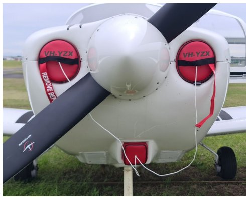
Zenith CH-2000, CH-640 Engine Inlet Plugs