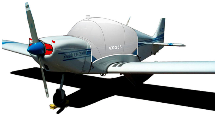
AMD Alarus CH2000 Std Canopy Cover & Engine Plugs (Illustration)

This cover type is made from Silver Acrylic Sunbrella canvas and is 100% lined with a soft and smooth microfiber. Bruce's Custom Covers developed this material combination especially for aircraft protection. The outer material is medium weight and treated for water resistance, UV resistance and anti-static buildup. The inner lining is a very soft and smooth microfiber to prevent scratching. The material is very reflective, and tests show that the cabin interior temperature can be reduced to near-ambient temperature on the hottest of days. It is water, ice and snow repellent, yet breathable to allow moisture to escape from between the cover and the aircraft surface.