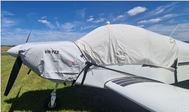
Zenith CH-2000 Canopy & Engine Covers

This cover type is made from Silver Acrylic Sunbrella canvas and is 100% lined with a soft and smooth microfiber. Bruce's Custom Covers developed this material combination especially for aircraft protection. The outer material is medium weight and treated for water resistance, UV resistance and anti-static buildup. The inner lining is a very soft and smooth microfiber to prevent scratching. The material is very reflective, and tests show that the cabin interior temperature can be reduced to near-ambient temperature on the hottest of days. It is water, ice and snow repellent, yet breathable to allow moisture to escape from between the cover and the aircraft surface.