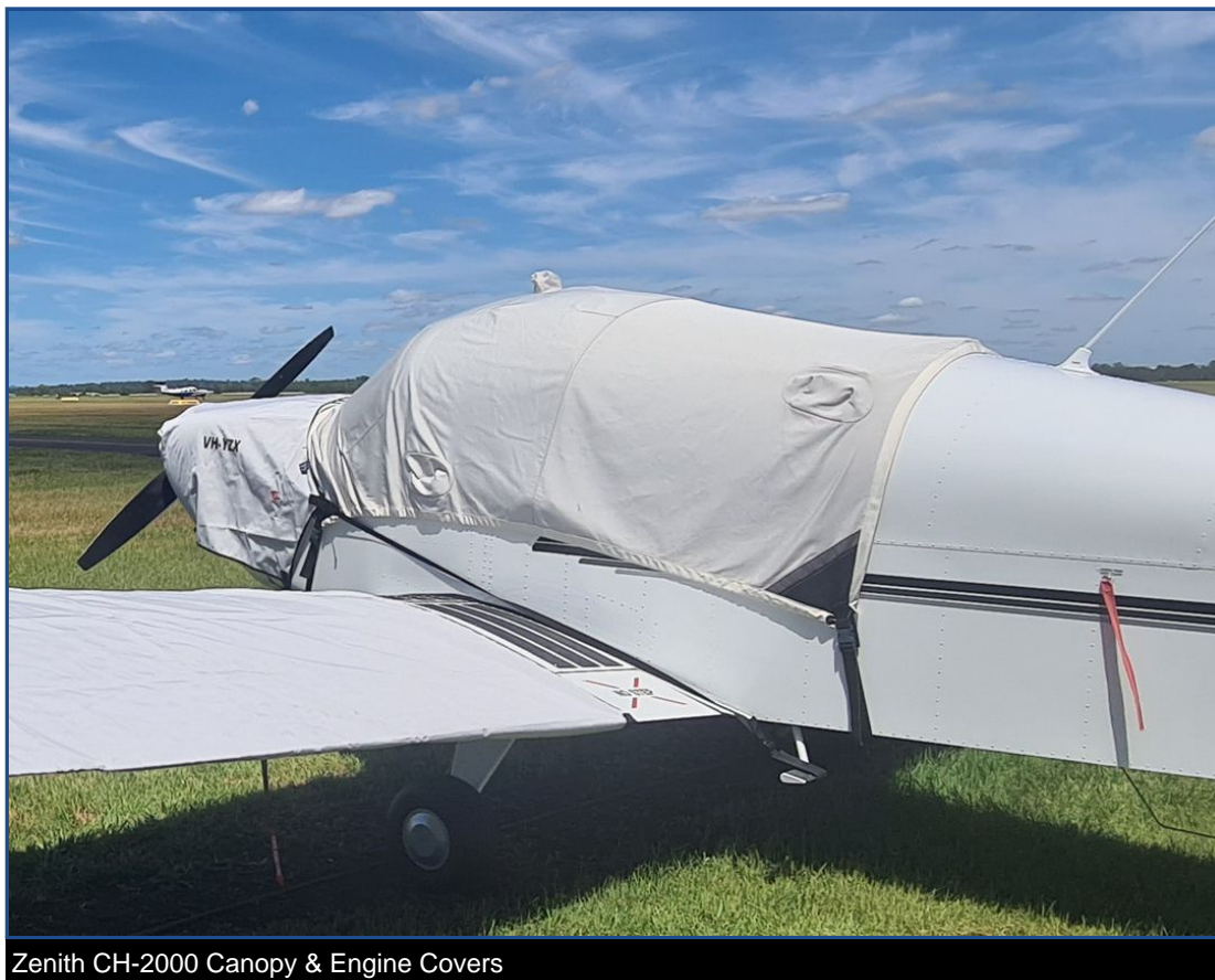
Zenith CH-2000 Canopy &amp; Engine Covers