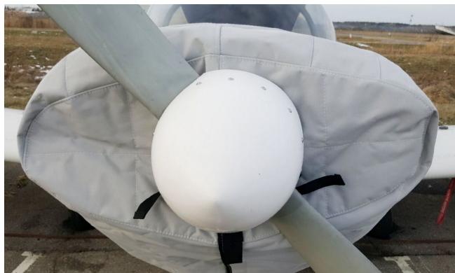
Zenith CH-2000 Insulated Engine Cover

This cover type is made from Silver Acrylic Sunbrella canvas and is 100% lined with a soft and smooth microfiber. Bruce's Custom Covers developed this material combination especially for aircraft protection. The outer material is medium weight and treated for water resistance, UV resistance and anti-static buildup. The inner lining is a very soft and smooth microfiber to prevent scratching. The material is very reflective, and tests show that the cabin interior temperature can be reduced to near-ambient temperature on the hottest of days. It is water, ice and snow repellent, yet breathable to allow moisture to escape from between the cover and the aircraft surface.