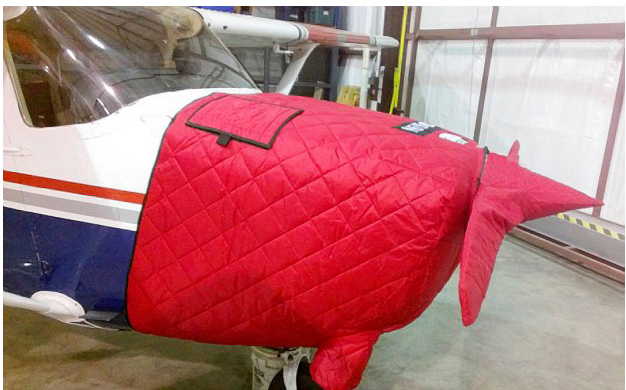
Cessna 172 Insulated Engine Cover w/ Oil Filler Door flap and Insulated Prop/Spinner Cover