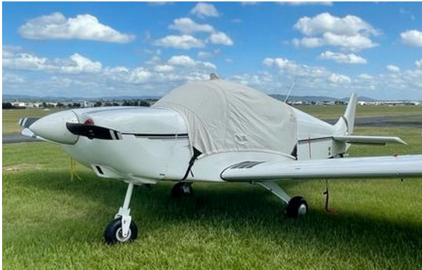
Zenith CH-2000, CH-640 Canopy Cover