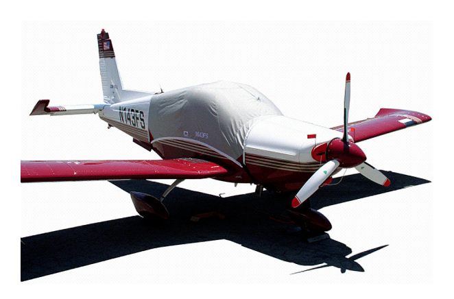
Zlin 143 Canopy Cover and Engine Plugs

This cover type is made from Silver Acrylic Sunbrella canvas and is 100% lined with a soft and smooth microfiber. Bruce's Custom Covers developed this material combination especially for aircraft protection. The outer material is medium weight and treated for water resistance, UV resistance and anti-static buildup. The inner lining is a very soft and smooth microfiber to prevent scratching. The material is very reflective, and tests show that the cabin interior temperature can be reduced to near-ambient temperature on the hottest of days. It is water, ice and snow repellent, yet breathable to allow moisture to escape from between the cover and the aircraft surface.