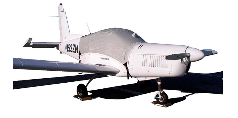
Zlin 143 Canopy Cover and Engine Plugs