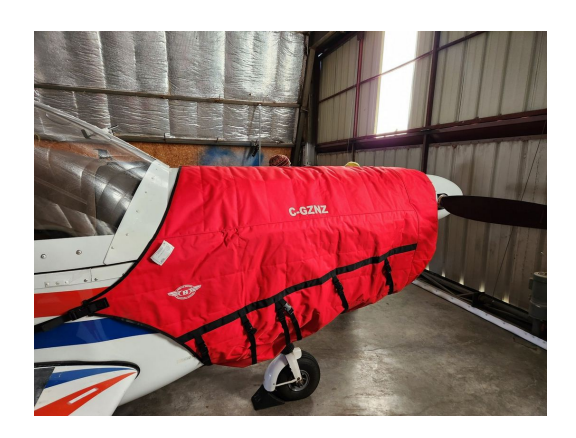
ZLIN 142C Insulated Engine Cover