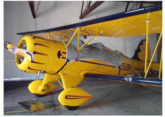
Waco YMF Canopy Cover