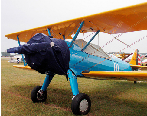
Stearman Canopy, Engine & Prop Covers

This cover type is made from Silver Acrylic Sunbrella canvas and is 100% lined with a soft and smooth microfiber. Bruce's Custom Covers developed this material combination especially for aircraft protection. The outer material is medium weight and treated for water resistance, UV resistance and anti-static buildup. The inner lining is a very soft and smooth microfiber to prevent scratching. The material is very reflective, and tests show that the cabin interior temperature can be reduced to near-ambient temperature on the hottest of days. It is water, ice and snow repellent, yet breathable to allow moisture to escape from between the cover and the aircraft surface.