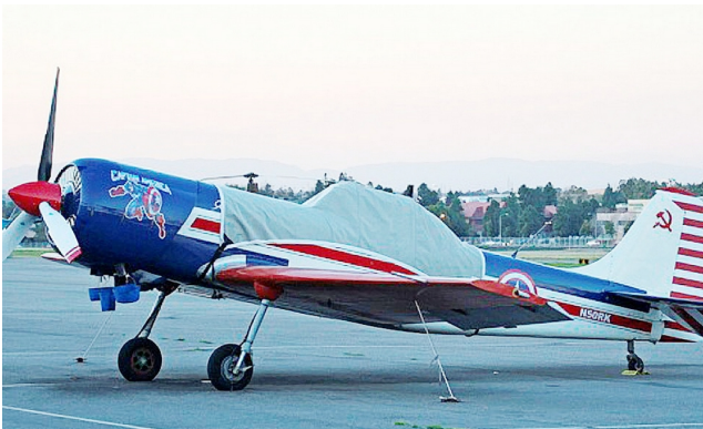
Yak 50 Canopy Cover

This cover type is made from Silver Acrylic Sunbrella canvas and is 100% lined with a soft and smooth microfiber. Bruce's Custom Covers developed this material combination especially for aircraft protection. The outer material is medium weight and treated for water resistance, UV resistance and anti-static buildup. The inner lining is a very soft and smooth microfiber to prevent scratching. The material is very reflective, and tests show that the cabin interior temperature can be reduced to near-ambient temperature on the hottest of days. It is water, ice and snow repellent, yet breathable to allow moisture to escape from between the cover and the aircraft surface.