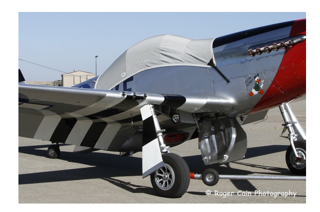
North American P-51 Canopy Cover

Engine Inlet Plugs are custom fit for your Yakovlev Yak 3 intakes, made with heavy-duty vinyl material, and stuffed with a single block of sculpted urethane foam. Each plug has a zipper that allows the foam to be removed and dried if necessary. Engine plugs have warning flags that are visible from the cockpit or 'remove before flight' streamers sewn onto the face of the plugs. Most plugs are imprinted with the aircraft registration number in black for an extra charge. Storage bag NOT included. Engine plugs may be inserted after flight when the engine is still warm. Engine Inlet Plugs are commonly referred to as Cowl Plugs, Intake Plugs, Cowl Blocks, Engine Blocks, and Engine Bungs.