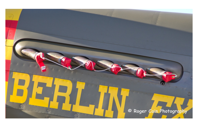
North American P-51 Exhaust Plugs