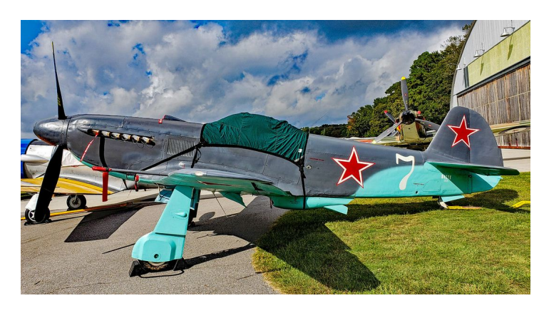
Yakovlev Yak 3 Canopy Cover (3u Models: Longer Canopy)