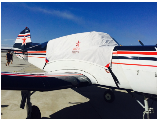
Yak 18 Canopy Cover