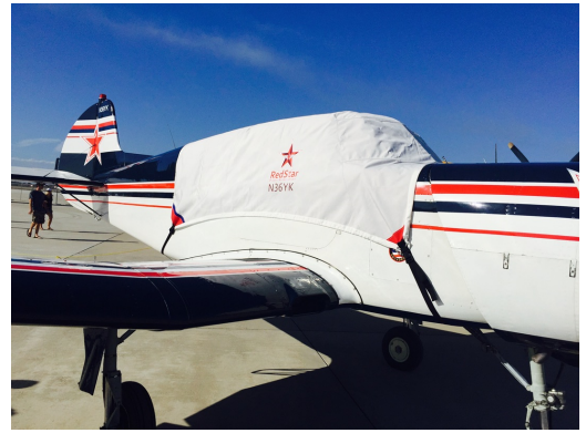
Yak 18 Canopy Cover