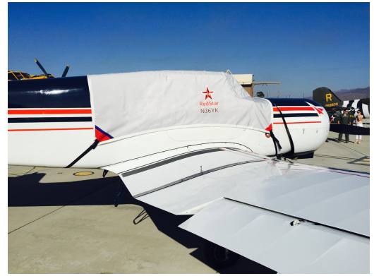
Yak 18 Canopy Cover