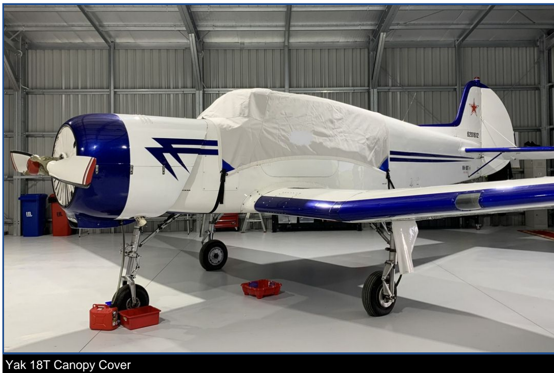
Yak 18T Canopy Cover