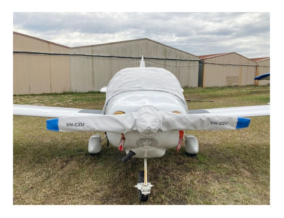
XL-2 PROPELLOR/SPINNER COVER

This cover type is made from Silver Acrylic Sunbrella canvas and is 100% lined with a soft and smooth microfiber. Bruce's Custom Covers developed this material combination especially for aircraft protection. The outer material is medium weight and treated for water resistance, UV resistance and anti-static buildup. The inner lining is a very soft and smooth microfiber to prevent scratching. The material is very reflective, and tests show that the cabin interior temperature can be reduced to near-ambient temperature on the hottest of days. It is water, ice and snow repellent, yet breathable to allow moisture to escape from between the cover and the aircraft surface.