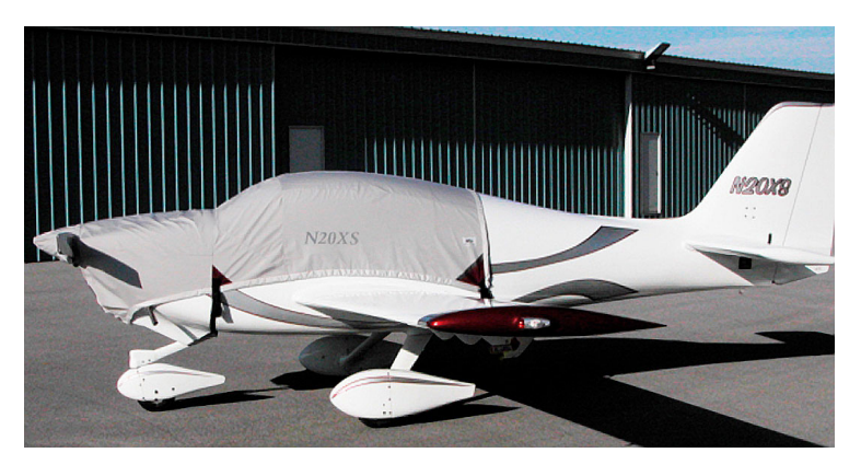
Canopy/Engine and Prop/Spinner Covers (tri-gear model)