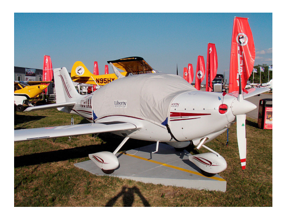
XL-2 Canopy Cover & Engine Plugs

This cover type is made from Silver Acrylic Sunbrella canvas and is 100% lined with a soft and smooth microfiber. Bruce's Custom Covers developed this material combination especially for aircraft protection. The outer material is medium weight and treated for water resistance, UV resistance and anti-static buildup. The inner lining is a very soft and smooth microfiber to prevent scratching. The material is very reflective, and tests show that the cabin interior temperature can be reduced to near-ambient temperature on the hottest of days. It is water, ice and snow repellent, yet breathable to allow moisture to escape from between the cover and the aircraft surface.