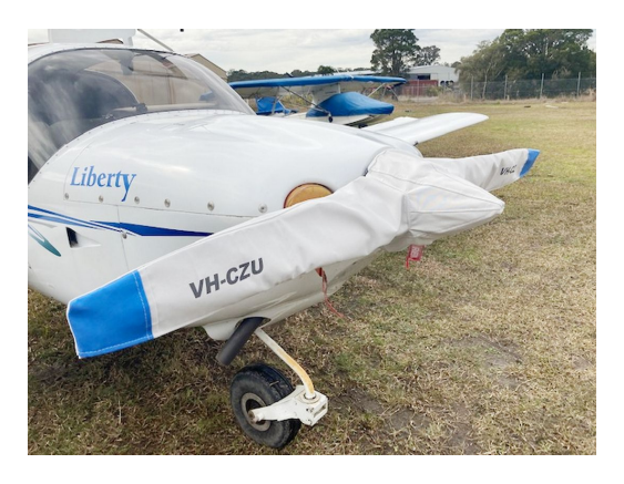
XL-2 PROPELLOR/SPINNER COVER