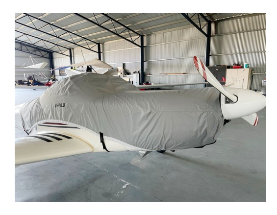
Ximango Travel Weight Canopy/Engine Cover