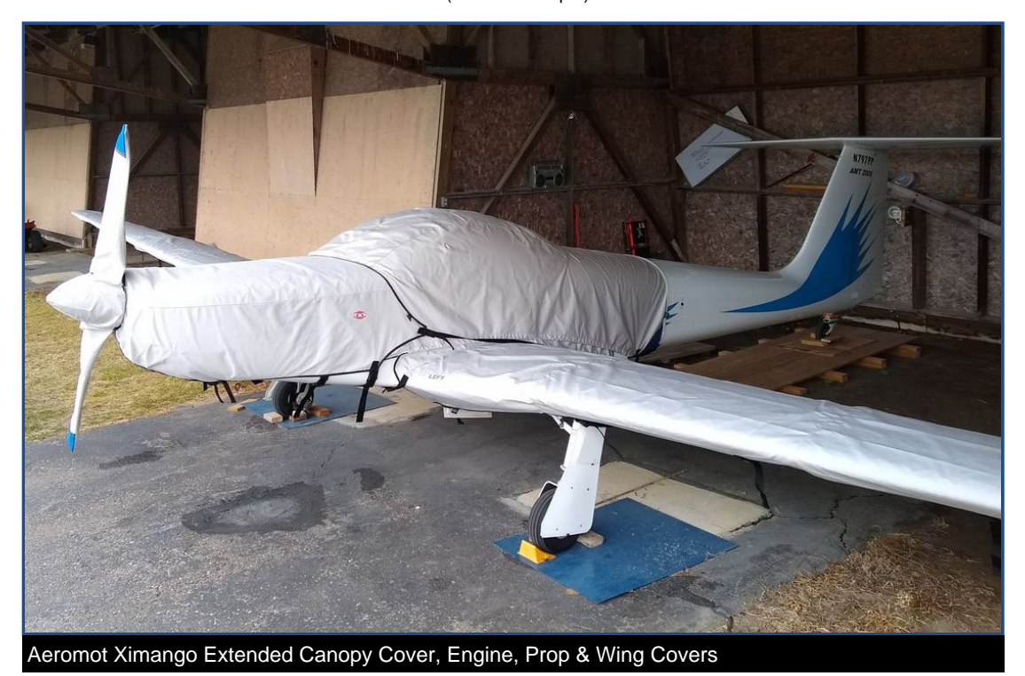
Section 1: Glider Canopy/Cockpit/Fuselage Covers