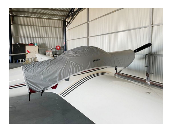
Ximango Travel Weight Canopy/Engine Cover