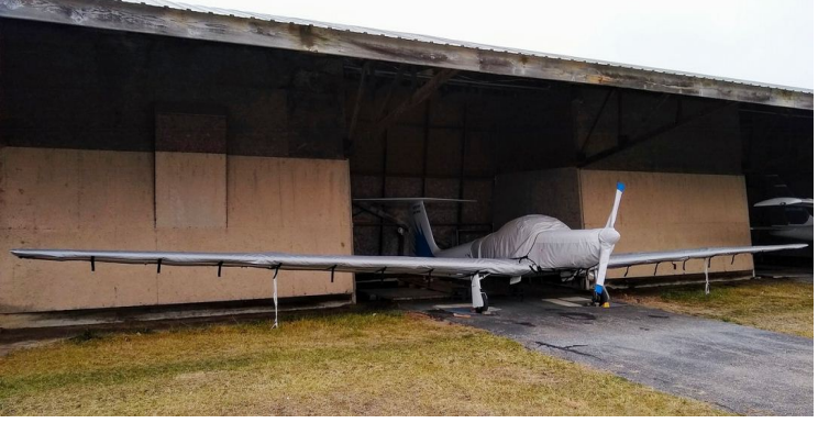
Aeromot Ximango Wing Covers