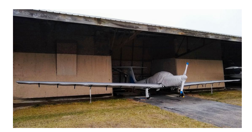
Aeromot Ximango Extended Canopy Cover, Engine, Prop & Wing Covers