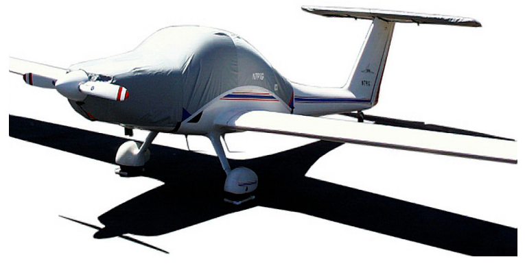
Grob 109 Canopy/Engine Cover & Horiz. Stabilizer Cover