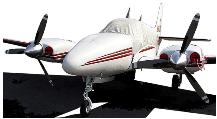
Baron 58 Standard Canopy Cover & Engine Plugs