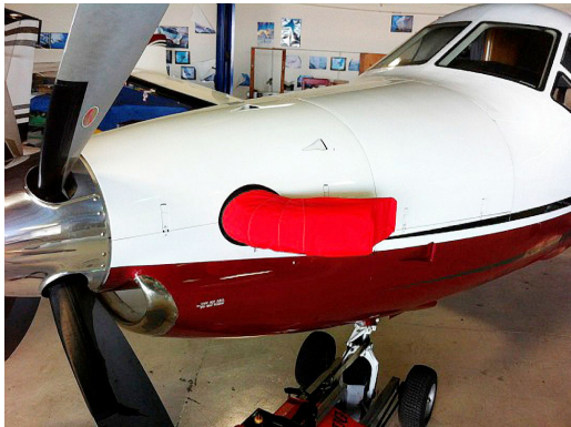
Pilatus PC-12 Exhaust Cover, Fully Enclosed, for protection against corrosion.

Prop Tie-Down/Exhaust Covers are made of heavy duty red vinyl material. Thick nylon webbing runs from the exhaust covers to the prop boot. This webbing is adjustable with plastic buckles, and is held tight with a steel spring where it attaches to the prop boot.