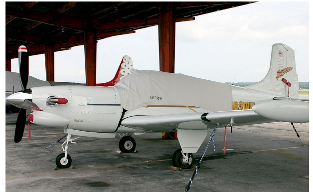
Beech Harpoon Canopy Cover, Exhaust Covers, Engine Plug