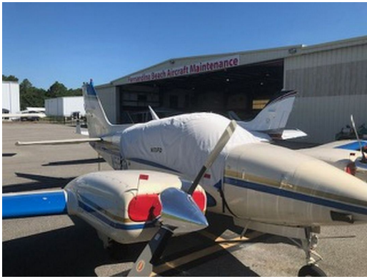
Beech Baron 95-B55 Canopy cover