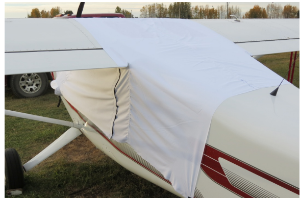
Pelican Canopy Cover (test fit cover)