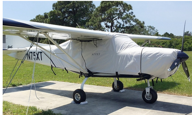
World Aircraft Extended Canopy Cover & Engine Cover