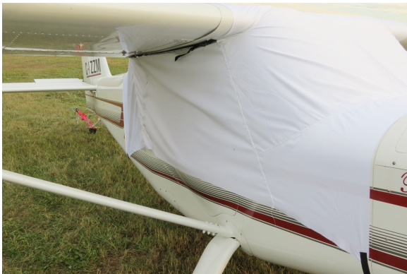
Pelican Canopy Cover (test fit cover)

This cover type is made from Silver Acrylic Sunbrella canvas and is 100% lined with a soft and smooth microfiber. Bruce's Custom Covers developed this material combination especially for aircraft protection. The outer material is medium weight and treated for water resistance, UV resistance and anti-static buildup. The inner lining is a very soft and smooth microfiber to prevent scratching. The material is very reflective, and tests show that the cabin interior temperature can be reduced to near-ambient temperature on the hottest of days. It is water, ice and snow repellent, yet breathable to allow moisture to escape from between the cover and the aircraft surface.