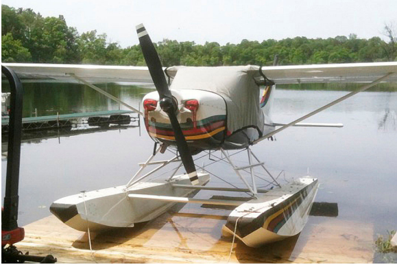
Glstar Sportsman Canopy Cover and Engine Plugs