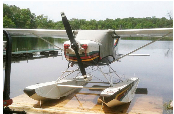
Glastar Sportsman Canopy Cover and Engine Plugs