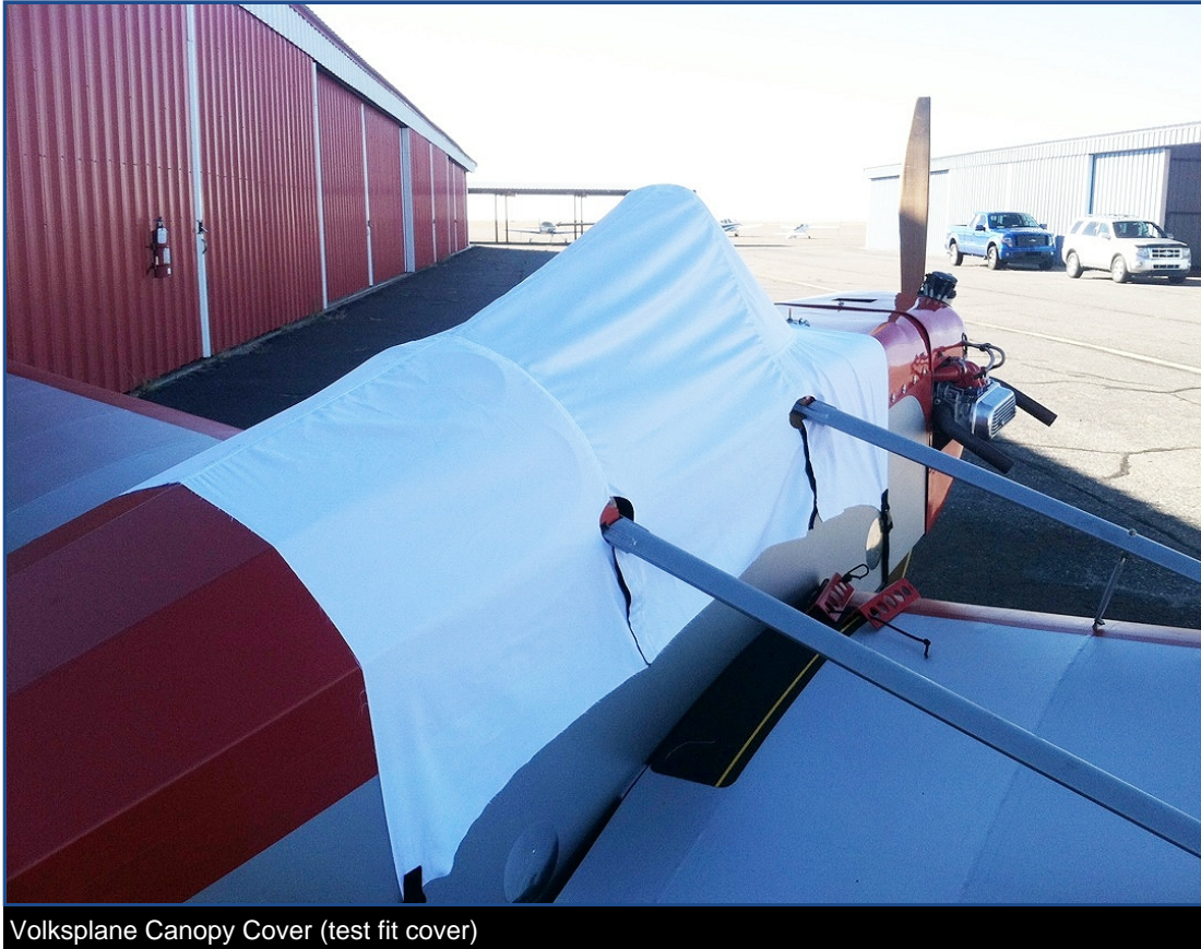
Volksplane Canopy Cover (test fit cover)