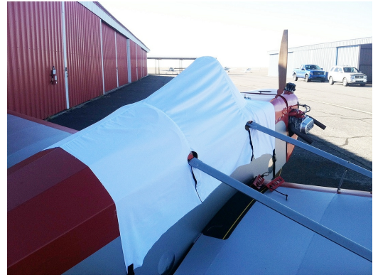
Volksplane Canopy Cover (test fit cover)