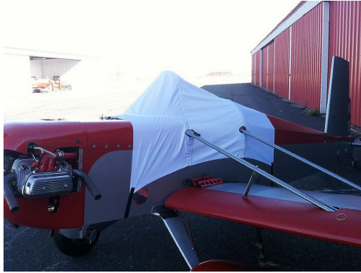
Volksplane Canopy Cover (test fit cover)

Travel Covers are made with Silver Solution-Dyed Polyester fabric and only lined over the windshield to save weight. The material is lightweight and more compact for easy stowage in the aircraft. The polyester material is water resistant, but only intended for occasional use outside. We also have an ultra lightweight material available for fitted hangar dust covers. For daily outdoor use, the non-travel Sunbrella Cover is the best choice.