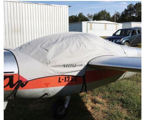
Aerotechnik L-13 Travel Cover