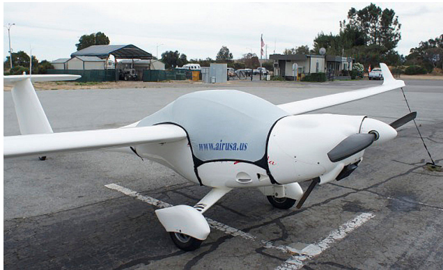
Lambada Travel Canopy Cover