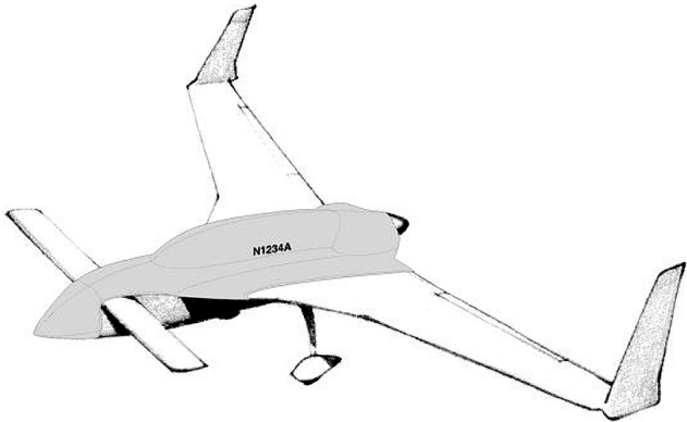
Rutan Long-EZ Canopy Cover