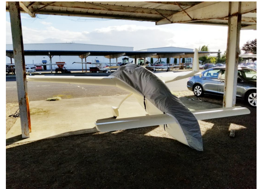
Rutan Vari EZ Travel Cover/Nose/Engine Cover