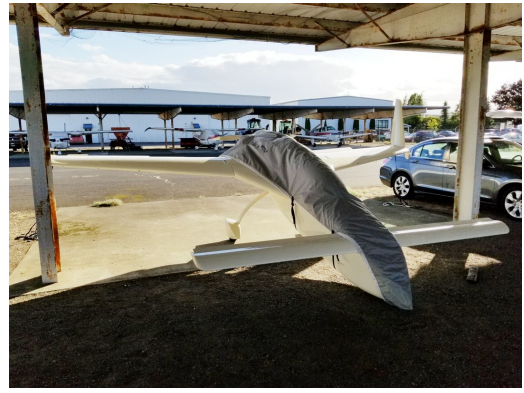
Rutan Vari EZ Travel Cover/Nose/Engine Cover