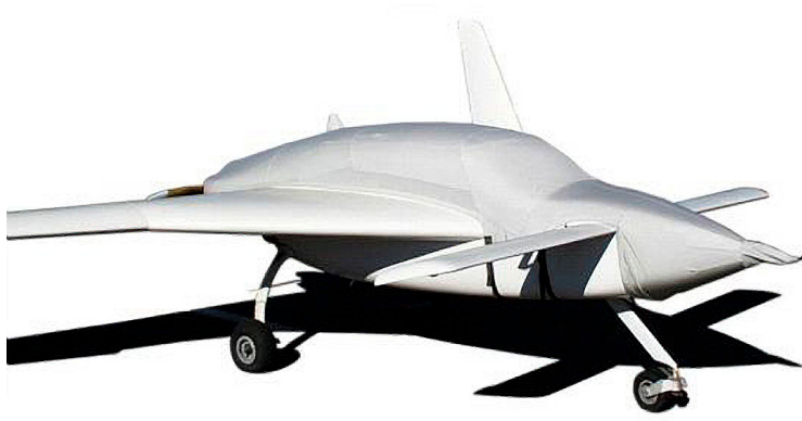
Velocity Canopy/Nose/Engine Cover