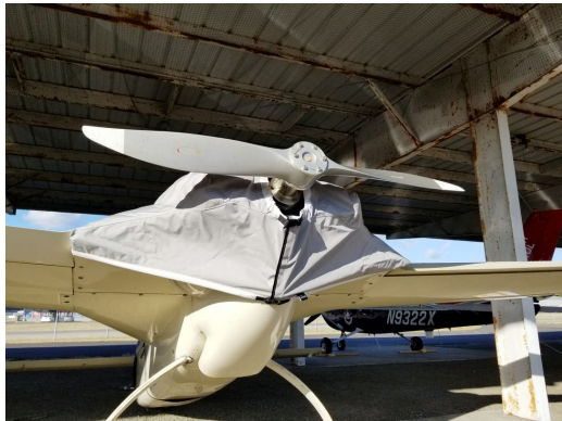
Rutan Vari EZ Travel Cover/Nose/Engine Cover