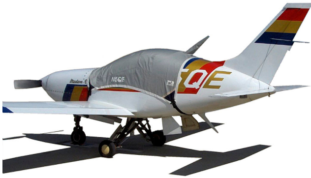
Questair Venture Canopy Cover