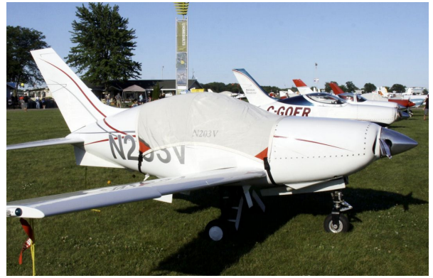
Questair Venture Canopy Cover