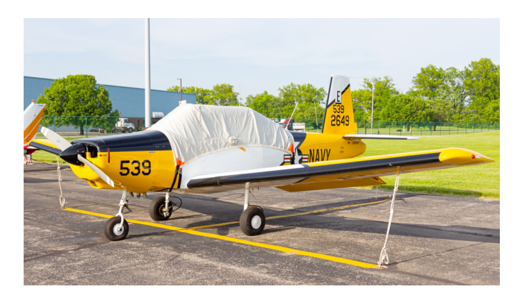
Varga Kachina Canopy Cover

This cover type is made from Silver Acrylic Sunbrella canvas and is 100% lined with a soft and smooth microfiber. Bruce's Custom Covers developed this material combination especially for aircraft protection. The outer material is medium weight and treated for water resistance, UV resistance and anti-static buildup. The inner lining is a very soft and smooth microfiber to prevent scratching. The material is very reflective, and tests show that the cabin interior temperature can be reduced to near-ambient temperature on the hottest of days. It is water, ice and snow repellent, yet breathable to allow moisture to escape from between the cover and the aircraft surface.