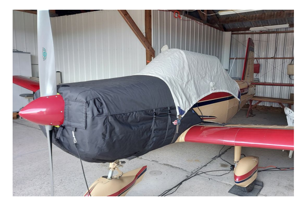
Varga 2150A Insulated Engine Cover, Canopy Cover