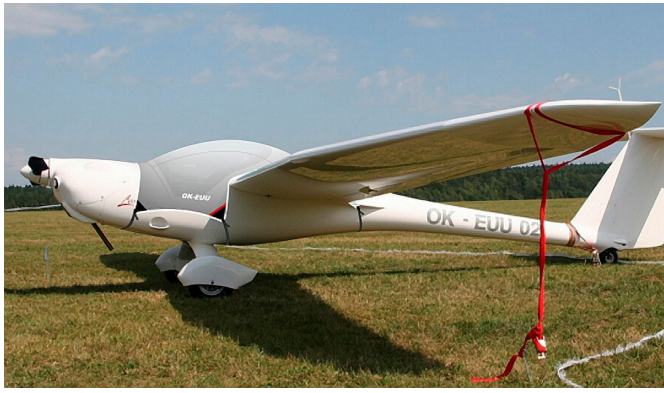
Lambda Canopy Cover (illustration)