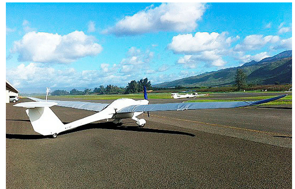
Distar Sundancer LSA Extended Canopy/Engine, Prop, Wheel pants, Wings & Empennage Covers Lambada Canopy/Engine Cover and Wing Covers