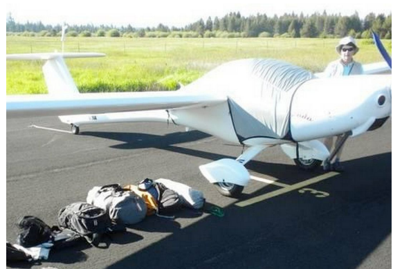
Distar Sundancer Travel Weight Canopy Cover