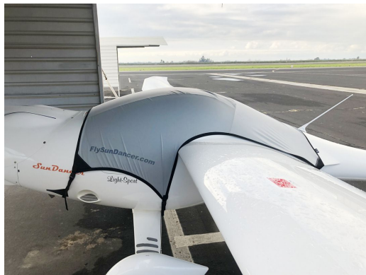
SUNDANCER Travel Cover with custom Imprint