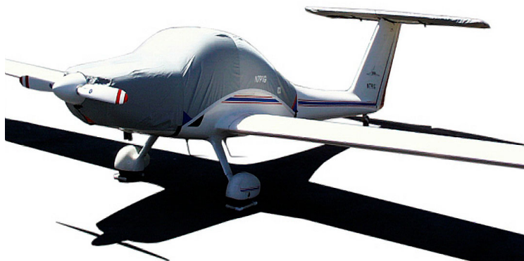
Grob 109 Canopy/Engine Cover & Horiz. Stabilizer Cover