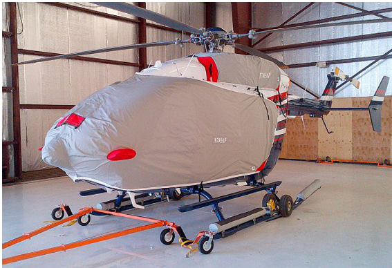
Bubble Cover w/ nose mounted radome & Upper Deck Plugs/Cover

Covers developed this material combination especially for aircraft protection. The outer material is medium weight and treated for water resistance, UV resistance and anti-static buildup. The inner lining is a very soft and smooth microfiber to prevent scratching. The material is very reflective, and tests show that the cabin interior temperature can be reduced to near-ambient temperature on the hottest of days. It is water, ice and snow repellent, yet breathable to allow moisture to escape from between the cover and the aircraft surface.