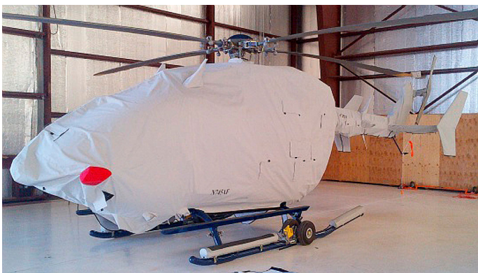
Main Body (also covers bottom), Tailboom, Vertical Pylon, Stabilizers and Tail Rotor Covers