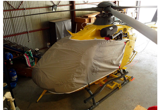
Eurocopter EC-135 Bubble Cover