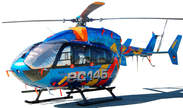
EC-145 Cabin Heatshield Set

Cockpit Heatshields are interior sunshades for the aircraft's cockpit. The product is a unique composite of closed-cell foam with a silver mylar finish. The semi-rigid design is stiff enough to stand inside the window framing. Darts and folds are incorporated into the material so that it conforms to the complex shape of the helicopter windows. The set folds up flat and is easily stored in the included storage sleeve. Some designs may require velcro and suction cups. A Heatshield is an excellent short-term remedy for cockpit overheating, but an external fabric cover is more effective for long-term protection.