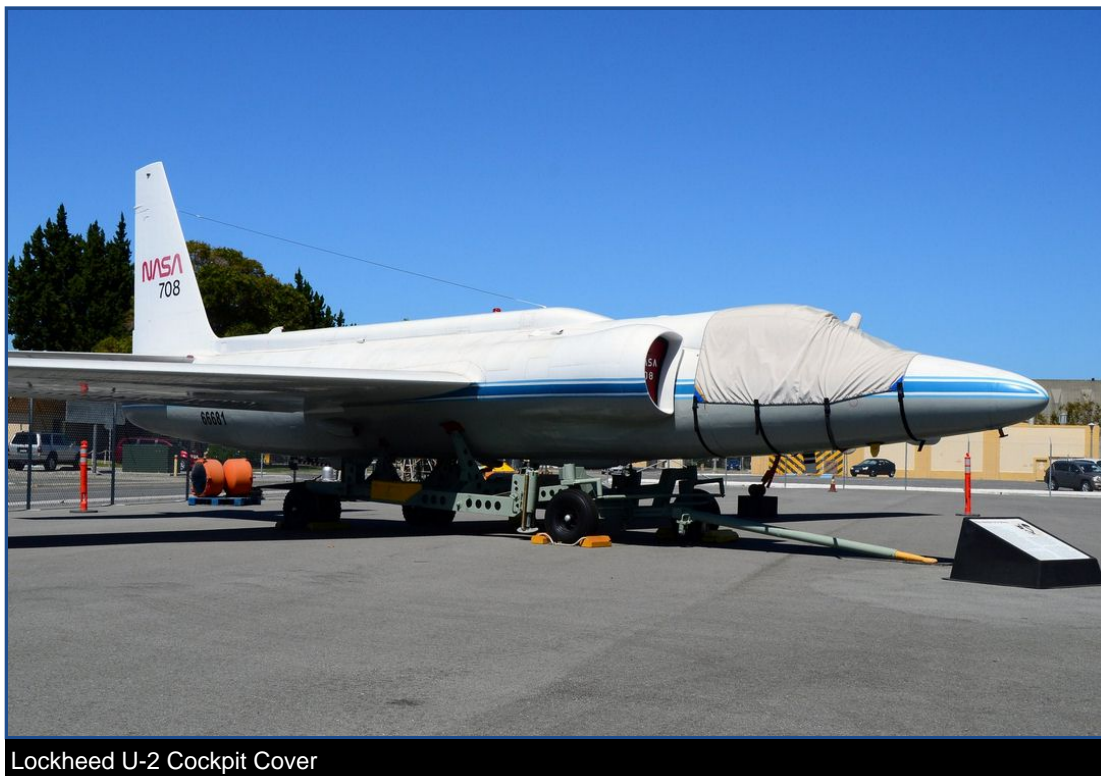
Lockheed U-2 Cockpit Cover