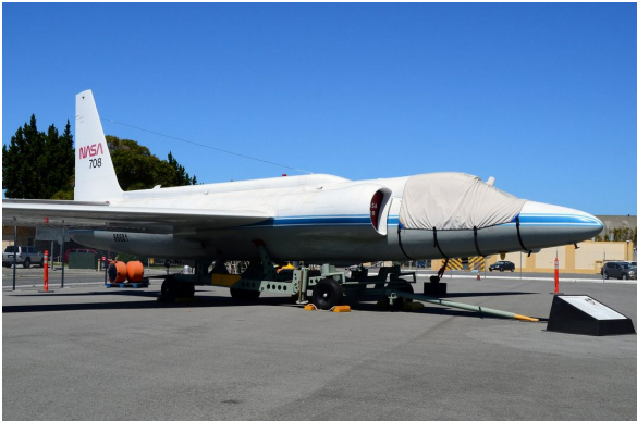
Lockheed U-2 Cockpit Cover