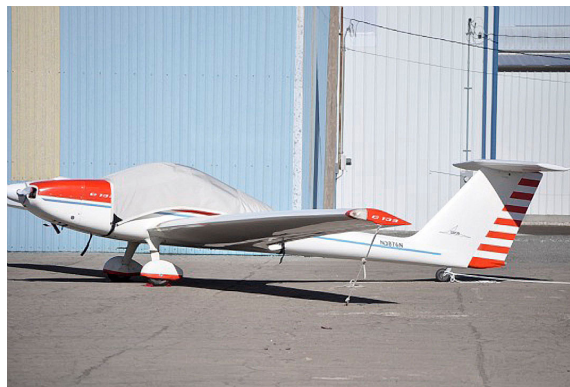
Grob 109 Canopy Cover