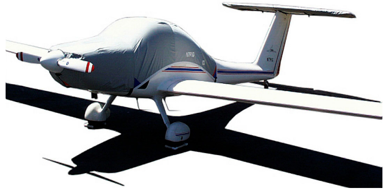
Grob 109 Canopy/Engine Cover & Horiz. Stabilizer Cover