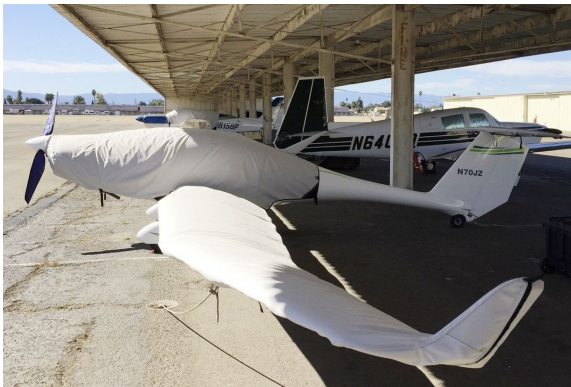
Phoenix Air U-15 Canopy/Engine, Wing & Horizontal Stabilizer Covers