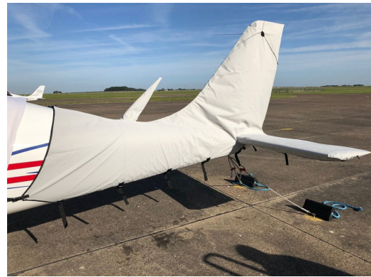
Tecnam P2008 Empennage Cover (Tailboom, Vertical & Horiz Stabilizers), All Year Use