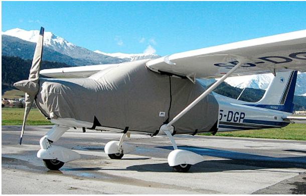
Tecnam Echo Extended Canopy, Engine, Prop Covers

the hottest of days. It is water, ice and snow repellent, yet breathable to allow moisture to escape from between the cover and the aircraft surface.