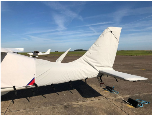
Tecnam P2008 Empennage Cover (Tailboom, Vertical & Horiz Stabilizers), All Year Use