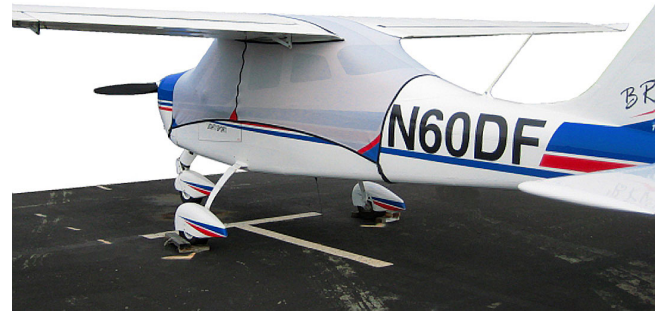
Tecnam Bravo Spandex FlyAway Travel Canopy Cover