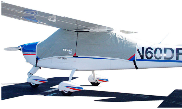
Tecnam Bravo Canopy Cover