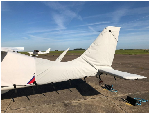
Tecnam P2008 Empennage Cover (Tailboom, Vertical & Horiz Stabilizers), All Year Use

WINTER USE MATERIAL - Made with Solution-Dyed Polyester fabric, this option is intended for seasonal use to aid in deicing, rain mitigation, or for occasional travel. The material is lighter and more compact, but more susceptible to UV damage and may have a shorter useful life if used continuously outside than the all-year use material.