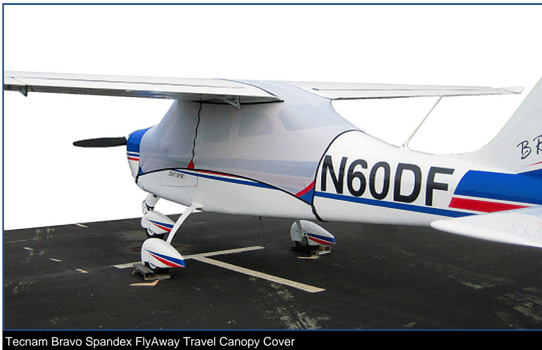
Tecnam Bravo Spandex FlyAway Travel Canopy Cover