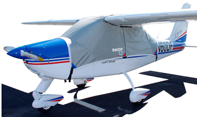
Tecnam Bravo Canopy Cover