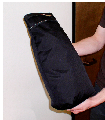
Light Weight Travel-Cover Mini-Storage Bag: 18" x 6" x 4"