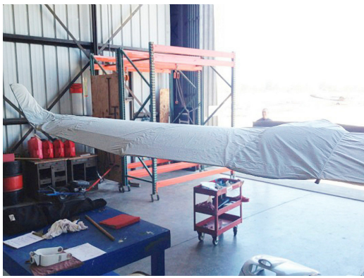
Tecnam Twin Wing/Engine Covers