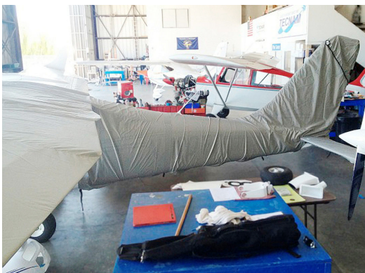
Tecnam Twin Wing & Empennage Covers

This cover type is made from Silver Acrylic Sunbrella canvas and is 100% lined with a soft and smooth microfiber. Bruce's Custom Covers developed this material combination especially for aircraft protection. The outer material is medium weight and treated for water resistance, UV resistance and anti-static buildup. The inner lining is a very soft and smooth microfiber to prevent scratching. The material is very reflective, and tests show that the cabin interior temperature can be reduced to near-ambient temperature on the hottest of days. It is water, ice and snow repellent, yet breathable to allow moisture to escape from between the cover and the aircraft surface.