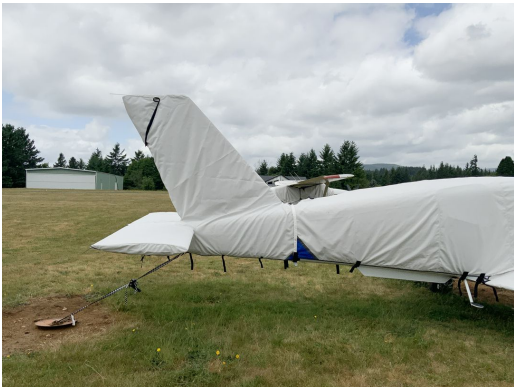
Socata Tampico TB-9C Cover Set