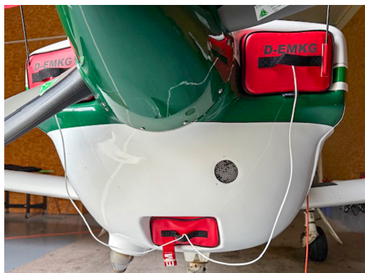
Trinidad TB20 Engine Inlet Plugs (set of 3)

Engine Inlet Plugs are custom fit for your Socata Tampico, Tobago & Trinidad intakes, made with heavy-duty vinyl material, and stuffed with a single block of sculpted urethane foam. Each plug has a zipper that allows the foam to be removed and dried if necessary. Engine plugs have warning flags that are visible from the cockpit or 'remove before flight' streamers sewn onto the face of the plugs. Most plugs are imprinted with the aircraft registration number in black for an extra charge. Storage bag NOT included. Engine plugs may be inserted after flight when the engine is still warm. Engine Inlet Plugs are commonly referred to as Cowl Plugs, Intake Plugs, Cowl Blocks, Engine Blocks, and Engine Bungs.