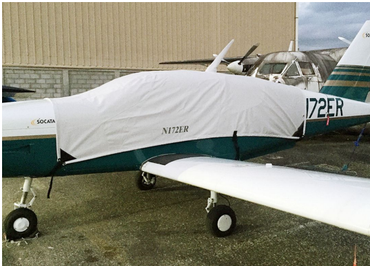
Socata TB 9 Tampico Canopy Cover

This cover type is made from Silver Acrylic Sunbrella canvas and is 100% lined with a soft and smooth microfiber. Bruce's Custom Covers developed this material combination especially for aircraft protection. The outer material is medium weight and treated for water resistance, UV resistance and anti-static buildup. The inner lining is a very soft and smooth microfiber to prevent scratching. The material is very reflective, and tests show that the cabin interior temperature can be reduced to near-ambient temperature on the hottest of days. It is water, ice and snow repellent, yet breathable to allow moisture to escape from between the cover and the aircraft surface.