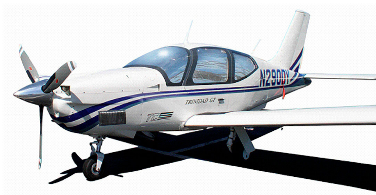
Socata TB20 HeatShields

Windshield Heatshields are interior sunshades for an aircraft's front windshield. The product is a unique composite of closed-cell foam with a silver mylar finish. The semi-rigid design is stiff enough to stand along the inside of the windshield using sun visors or window framing. It folds up flat and easily stores in the included storage sleeve. Some designs may require velcro and suction cups or split right and left sides. A Heatshield is an excellent short-term remedy for cockpit overheating. An external fabric cover is far more effective and practical for long-term protection.