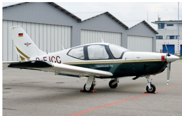
Socata Tobago TB20 Heatshields