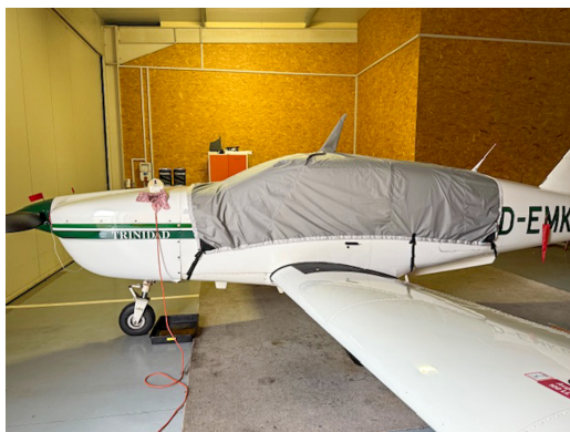
Trinidad TB20 Travel Cover, Light Weight Canopy Cover

Travel Covers are made with Silver Solution-Dyed Polyester fabric and only lined over the windshield to save weight. The material is lightweight and more compact for easy stowage in the aircraft. The polyester material is water resistant, but only intended for occasional use outside. We also have an ultra lightweight material available for fitted hangar dust covers. For daily outdoor use, the non-travel Sunbrella Cover is the best choice.