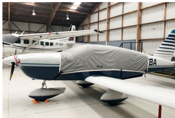
Socata TB-9 TRAVEL COVER, Light Weight Canopy Cover