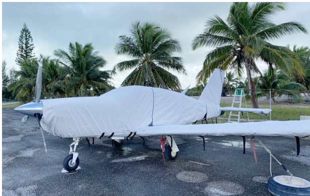
Socata Trinidad Full Cover Set

WINTER USE MATERIAL - Made with Solution-Dyed Polyester fabric, this option is intended for seasonal use to aid in deicing, rain mitigation, or for occasional travel. The material is lighter and more compact, but more susceptible to UV damage and may have a shorter useful life if used continuously outside than the all-year use material.