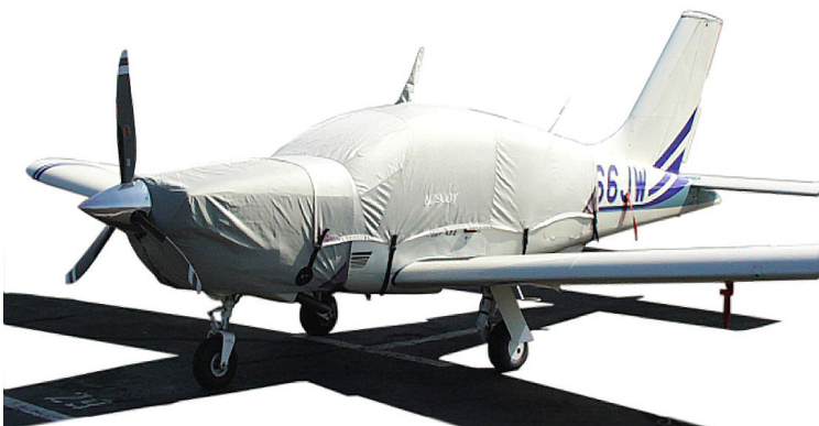
Trinidad/Tobago Canopy Cover & Engine Covers