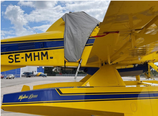
Air Tractor Light Weight Canopy Cover

Travel Covers are made with Silver Solution-Dyed Polyester fabric and only lined over the windshield to save weight. The material is lightweight and more compact for easy stowage in the aircraft. The polyester material is water resistant, but only intended for occasional use outside. We also have an ultra lightweight material available for fitted hangar dust covers. For daily outdoor use, the non-travel Sunbrella Cover is the best choice.