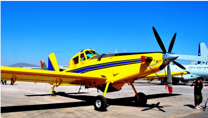
Air Tractor Prop Tie/Exhaust Covers

This cover type is made from Silver Acrylic Sunbrella canvas and is 100% lined with a soft and smooth microfiber. Bruce's Custom Covers developed this material combination especially for aircraft protection. The outer material is medium weight and treated for water resistance, UV resistance and anti-static buildup. The inner lining is a very soft and smooth microfiber to prevent scratching. The material is very reflective, and tests show that the cabin interior temperature can be reduced to near-ambient temperature on the hottest of days. It is water, ice and snow repellent, yet breathable to allow moisture to escape from between the cover and the aircraft surface.