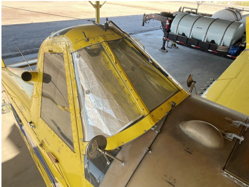
Air Tractor Cockpit HeatShields

foam with a silver mylar finish. The semi-rigid design is stiff enough to stand along the inside of the windshield using sun visors or window framing. It folds up flat and easily stores in the included storage sleeve. Some designs may require velcro and suction cups or split right and left sides. A Heatshield is an excellent short-term remedy for cockpit overheating. An external fabric cover is far more effective and practical for long-term protection.