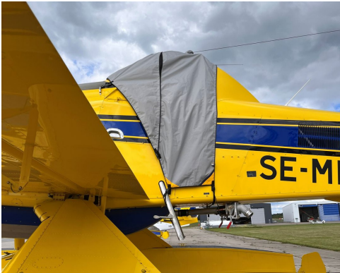
Air Tractor Light Weight Canopy Cover