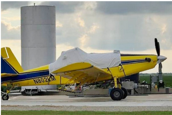
Air Tractor Inc AT-802A Canopy/Hopper Cover