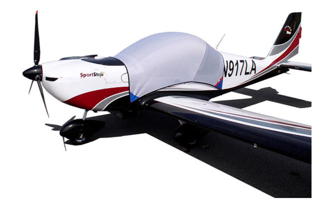
Evektor Sportstar Light Weight Travel-Cover