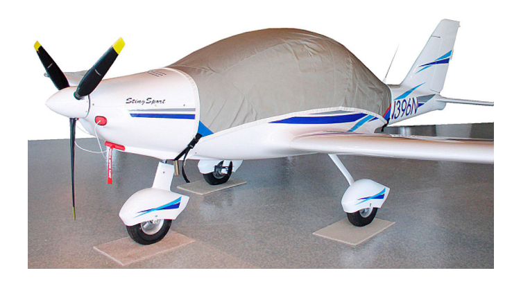
Sting Sport Canopy Cover & Engine Plugs

This cover type is made from Silver Acrylic Sunbrella canvas and is 100% lined with a soft and smooth microfiber. Bruce's Custom Covers developed this material combination especially for aircraft protection. The outer material is medium weight and treated for water resistance, UV resistance and anti-static buildup. The inner lining is a very soft and smooth microfiber to prevent scratching. The material is very reflective, and tests show that the cabin interior temperature can be reduced to near-ambient temperature on the hottest of days. It is water, ice and snow repellent, yet breathable to allow moisture to escape from between the cover and the aircraft surface.