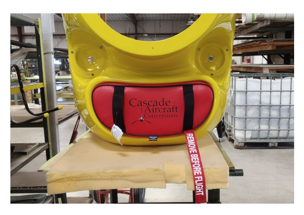
Thrush Intake Plug (Cascade Conversion)