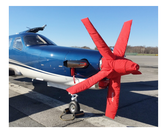
Socata TBM Insulated 5-Blade Prop/Spinner Cover