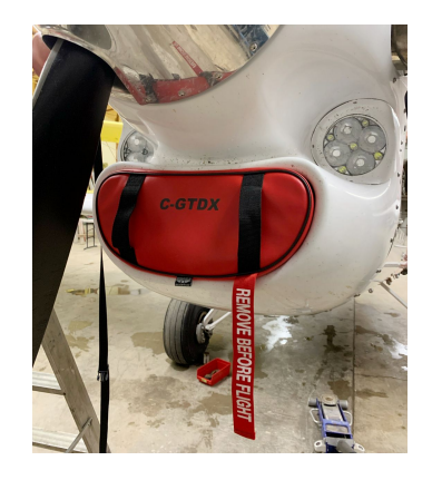
Ayres Thrush Intake Plug (Cascade Conversion)

Engine Inlet Plugs are custom fit for your Ayres Thrush intakes, made with heavy-duty vinyl material, and stuffed with a single block of sculpted urethane foam. Each plug has a zipper that allows the foam to be removed and dried if necessary. Engine plugs have warning flags that are visible from the cockpit or 'remove before flight' streamers sewn onto the face of the plugs. Most plugs are imprinted with the aircraft registration number in black for an extra charge. Storage bag NOT included. Engine plugs may be inserted after flight when the engine is still warm. Engine Inlet Plugs are commonly referred to as Cowl Plugs, Intake Plugs, Cowl Blocks, Engine Blocks, and Engine Bungs.