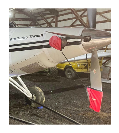
Ayres Thrush Prop Tie/Exhaust Covers

This cover type is made from Silver Acrylic Sunbrella canvas and is 100% lined with a soft and smooth microfiber. Bruce's Custom Covers developed this material combination especially for aircraft protection. The outer material is medium weight and treated for water resistance, UV resistance and anti-static buildup. The inner lining is a very soft and smooth microfiber to prevent scratching. The material is very reflective, and tests show that the cabin interior temperature can be reduced to near-ambient temperature on the hottest of days. It is water, ice and snow repellent, yet breathable to allow moisture to escape from between the cover and the aircraft surface.