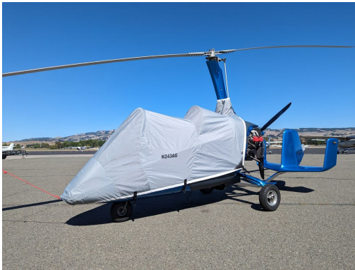
Autogyro MTOSPORT Travel Cover, Light Weight Canopy/Nose Cover

Travel Covers are made with Silver Solution-Dyed Polyester fabric and fully lined over the entire cover. The material is lightweight and more compact for easy stowage in the aircraft. The polyester material is water resistant, but only intended for occasional use outside. We also have an ultra lightweight material available for fitted hangar dust covers. For daily outdoor use, the non-travel Sunbrella Cover is the best choice.