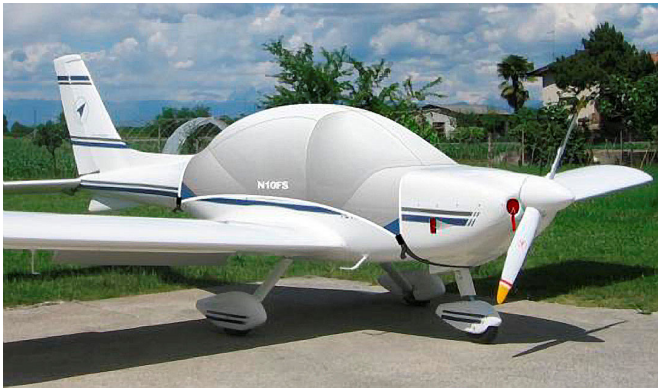
Texan Canopy Cover & Engine Plugs (Illustration)