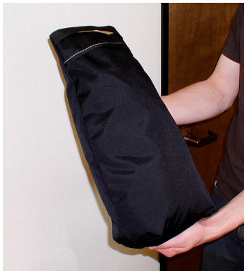
Light Weight Travel-Cover Mini-Storage Bag: 18" x 6" x 4"

The material is very reflective, and tests show that the cabin interior temperature can be reduced to near-ambient temperature on the hottest of days. It is water, ice and snow repellent, yet breathable to allow moisture to escape from between the cover and the aircraft surface.