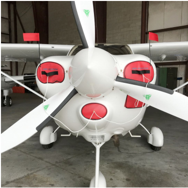
Tecnam P2010 Engine Plugs