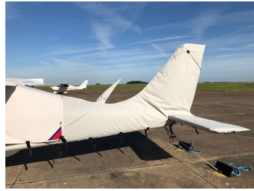
Tecnam P2010 Wing, Empennage & Prop Covers