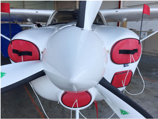
Tecnam Engine Plugs, set of 5

Engine Inlet Plugs are custom fit for your Tecnam P92 Eaglet intakes, made with heavy-duty vinyl material, and stuffed with a single block of sculpted urethane foam. Each plug has a zipper that allows the foam to be removed and dried if necessary. Engine plugs have warning flags that are visible from the cockpit or 'remove before flight' streamers sewn onto the face of the plugs. Most plugs are imprinted with the aircraft registration number in black for an extra charge. Storage bag NOT included. Engine plugs may be inserted after flight when the engine is still warm. Engine Inlet Plugs are commonly referred to as Cowl Plugs, Intake Plugs, Cowl Blocks, Engine Blocks, and Engine Bungs.