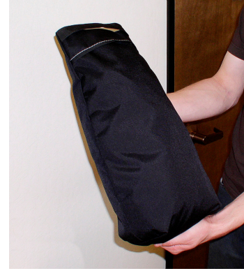
Light Weight Travel-Cover Mini-Storage Bag: 18" x 6" x 4"