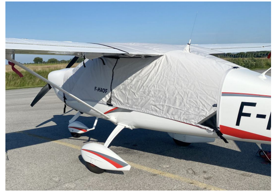
Tecnam P2010 Over-Top Canopy Cover