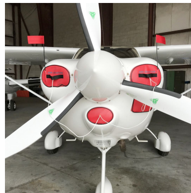
Tecnam P2010 Engine Plugs