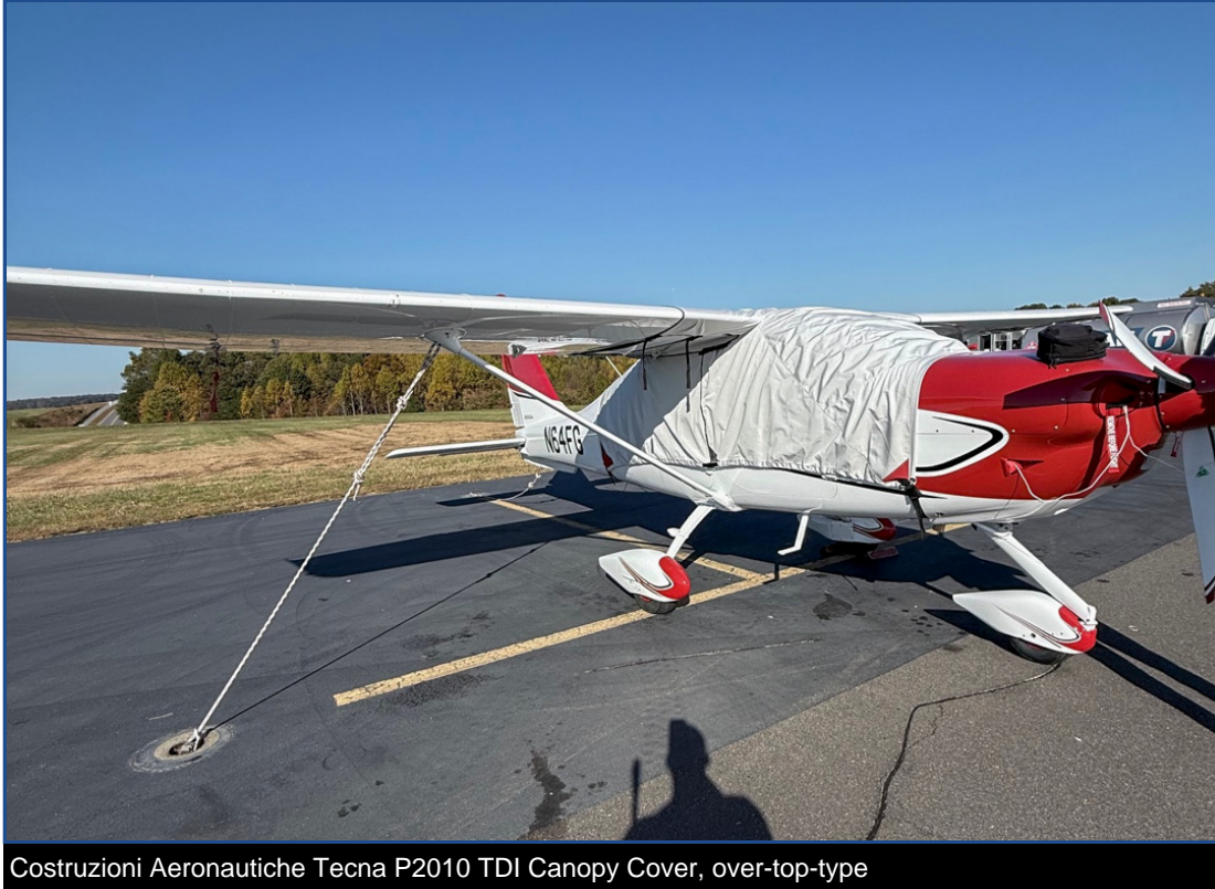
Costruzioni Aeronautiche Tecna P2010 TDI Canopy Cover, over-top-type