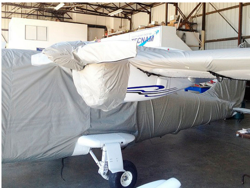
Tecnam Twin Canopy/Nose, Empennage, Wing/Engine, & Propellor/Spinner Covers

This cover type is made from Silver Acrylic Sunbrella canvas and is 100% lined with a soft and smooth microfiber. Bruce's Custom Covers developed this material combination especially for aircraft protection. The outer material is medium weight and treated for water resistance, UV resistance and anti-static buildup. The inner lining is a very soft and smooth microfiber to prevent scratching. The material is very reflective, and tests show that the cabin interior temperature can be reduced to near-ambient temperature on the hottest of days. It is water, ice and snow repellent, yet breathable to allow moisture to escape from between the cover and the aircraft surface.