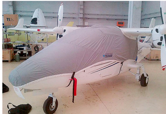
Tecnam P2006T Twin Lightweight Travel Canopy/Nose Cover

Travel Covers are made with Silver Solution-Dyed Polyester fabric and only lined over the windshield to save weight. The material is lightweight and more compact for easy stowage in the aircraft. The polyester material is water resistant, but only intended for occasional use outside. We also have an ultra lightweight material available for fitted hangar dust covers. For daily outdoor use, the non-travel Sunbrella Cover is the best choice.