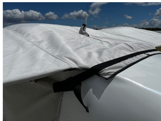
Tecnam P2006T Twin Wing & Engine Covers, All Year Use