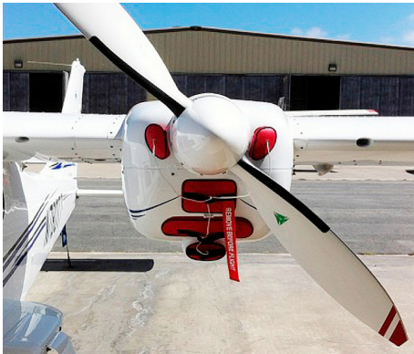
Tecnam P2006T Engine Plugs

Engine Inlet Plugs are custom fit for your Tecnam P2006T Twin intakes, made with heavy-duty vinyl material, and stuffed with a single block of sculpted urethane foam. Each plug has a zipper that allows the foam to be removed and dried if necessary. Engine plugs have warning flags that are visible from the cockpit or 'remove before flight' streamers sewn onto the face of the plugs. Most plugs are imprinted with the aircraft registration number in black for an extra charge. Storage bag NOT included. Engine plugs may be inserted after flight when the engine is still warm. Engine Inlet Plugs are commonly referred to as Cowl Plugs, Intake Plugs, Cowl Blocks, Engine Blocks, and Engine Bunges.