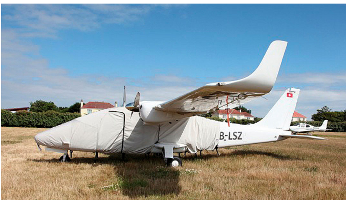
Tecnam Twin Extended Canopy/Nose Cover

This cover type is made from Silver Acrylic Sunbrella canvas and is 100% lined with a soft and smooth microfiber. Bruce's Custom Covers developed this material combination especially for aircraft protection. The outer material is medium weight and treated for water resistance, UV resistance and anti-static buildup. The inner lining is a very soft and smooth microfiber to prevent scratching. The material is very reflective, and tests show that the cabin interior temperature can be reduced to near-ambient temperature on the hottest of days. It is water, ice and snow repellent, yet breathable to allow moisture to escape from between the cover and the aircraft surface.