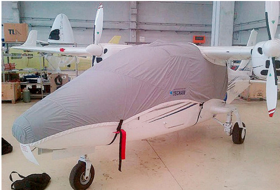
Tecnam P2006T Twin Lightweight Travel Canopy/Nose Cover

Travel Covers are made with Silver Solution-Dyed Polyester fabric and only lined over the windshield to save weight. The material is lightweight and more compact for easy stowage in the aircraft. The polyester material is water resistant, but only intended for occasional use outside. We also have an ultra lightweight material available for fitted hangar dust covers. For daily outdoor use, the non-travel Sunbrella Cover is the best choice.