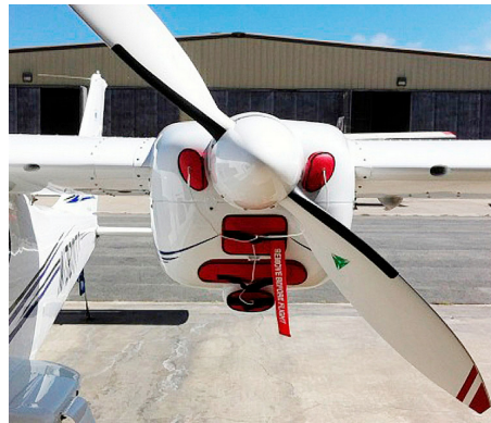
Tecnam P2006T Engine Plugs

Engine Inlet Plugs are custom fit for your Tecnam P2006T Twin intakes, made with heavy-duty vinyl material, and stuffed with a single block of sculpted urethane foam. Each plug has a zipper that allows the foam to be removed and dried if necessary. Engine plugs have warning flags that are visible from the cockpit or 'remove before flight' streamers sewn onto the face of the plugs. Most plugs are imprinted with the aircraft registration number in black for an extra charge. Storage bag NOT included. Engine plugs may be inserted after flight when the engine is still warm. Engine Inlet Plugs are commonly referred to as Cowl Plugs, Intake Plugs, Cowl Blocks, Engine Blocks, and Engine Bungs.