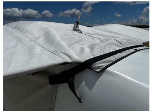
Tecnam P2006T Twin Wing & Engine Covers, All Year Use