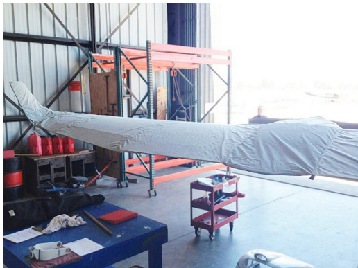
Tecnam Twin Wing/Engine Covers

This cover type is made from Silver Acrylic Sunbrella canvas and is 100% lined with a soft and smooth microfiber. Bruce's Custom Covers developed this material combination especially for aircraft protection. The outer material is medium weight and treated for water resistance, UV resistance and anti-static buildup. The inner lining is a very soft and smooth microfiber to prevent scratching. The material is very reflective, and tests show that the cabin interior temperature can be reduced to near-ambient temperature on the hottest of days. It is water, ice and snow repellent, yet breathable to allow moisture to escape from between the cover and the aircraft surface.