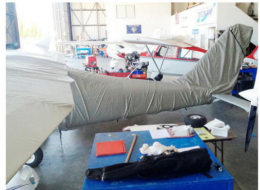
Tecnam Twin Canopy/Nose, Empennage, Wing/Engine, & Propellor/Spinner Covers Tecnam Twin Wing & Empennage Covers