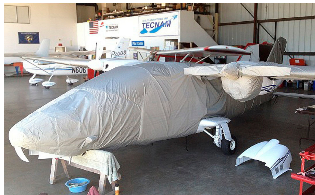
Tecnam Twin Canopy/Nose, Empennage, Wing/Engine, & Propeller/Spinner Covers