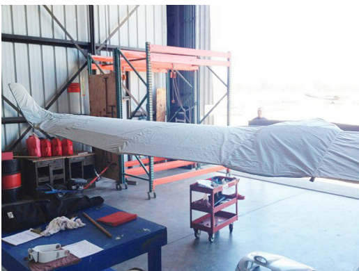
Tecnam Twin Wing/Engine Covers

WINTER USE MATERIAL - Made with Solution-Dyed Polyester fabric, this option is intended for seasonal use to aid in deicing, rain mitigation, or for occasional travel. The material is lighter and more compact, but more susceptible to UV damage and may have a shorter useful life if used continuously outside than the all-year use material.