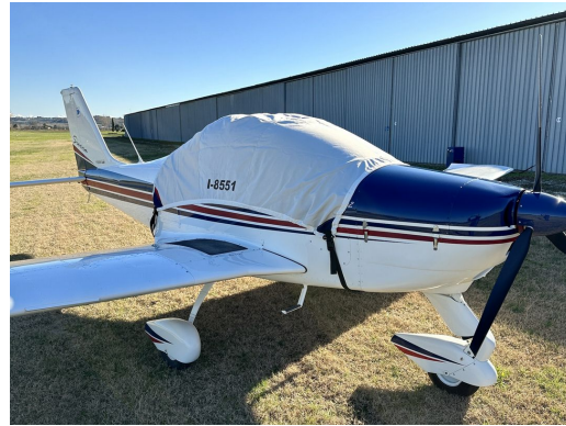
Tecnam P2002 Sierra Canopy Cover