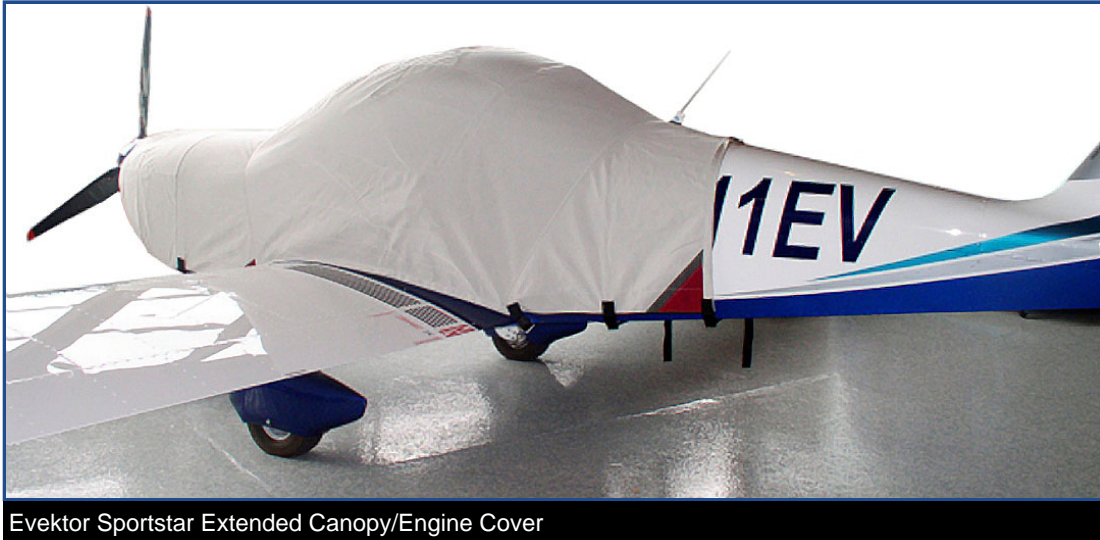
Evektor Sportstar Extended Canopy/Engine Cover