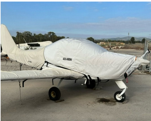
Tecnam Sierra Complete Cover Set

This cover type is made from Silver Acrylic Sunbrella canvas and is 100% lined with a soft and smooth microfiber. Bruce's Custom Covers developed this material combination especially for aircraft protection. The outer material is medium weight and treated for water resistance, UV resistance and anti-static buildup. The inner lining is a very soft and smooth microfiber to prevent scratching. The material is very reflective, and tests show that the cabin interior temperature can be reduced to near-ambient temperature on the hottest of days. It is water, ice and snow repellent, yet breathable to allow moisture to escape from between the cover and the aircraft surface.