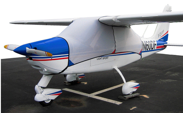
Tecnam Bravo Spandex FlyAway Travel Canopy Cover