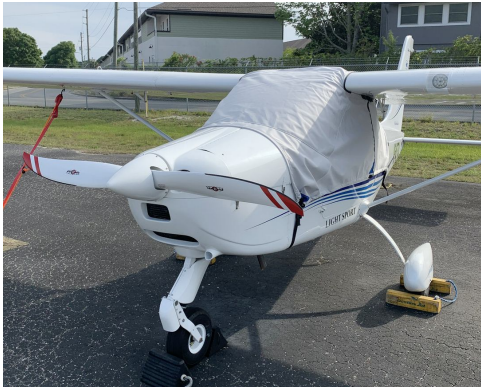
Tecnam P92 EAGLET Canopy Cover Over theTop Style

Travel Covers are made with Silver Solution-Dyed Polyester fabric and only lined over the windshield to save weight. The material is lightweight and more compact for easy stowage in the aircraft. The polyester material is water resistant, but only intended for occasional use outside. We also have an ultra lightweight material available for fitted hangar dust covers. For daily outdoor use, the non-travel Sunbrella Cover is the best choice.