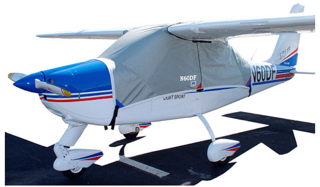
Tecnam Bravo Canopy Cover