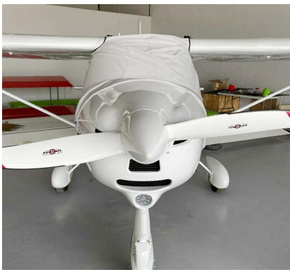
Tecnam P92 Echo Super Canopy Cover, Wrap-Around