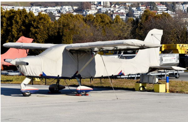
Tecnam P92 Echo Complete Cover Set