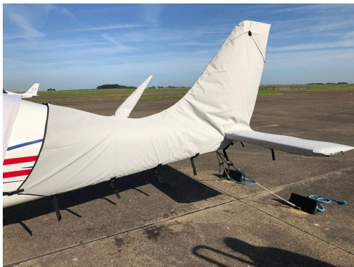
Tecnam P2008 Empennage Cover (Tailboom, Vertical & Horiz Stabilizers), All Year Use

WINTER USE MATERIAL - Made with Solution-Dyed Polyester fabric, this option is intended for seasonal use to aid in deicing, rain mitigation, or for occasional travel. The material is lighter and more compact, but more susceptible to UV damage and may have a shorter useful life if used continuously outside than the all-year use material.