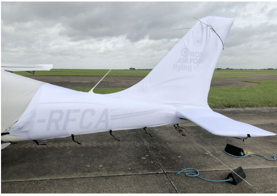
Tecnam P2008 Empennage Cover, test fit cover