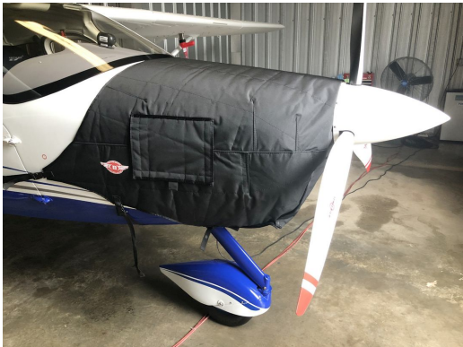
Tecnam P2008 Insulated Engine Cover