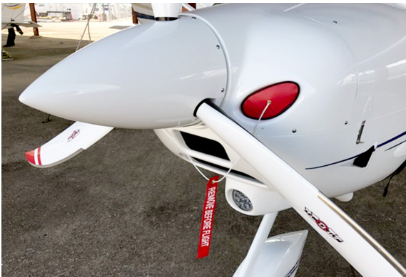
Tecnam P2008 Engine Inlet Plugs

Engine Inlet Plugs are custom fit for your Tecnam P2008 intakes, made with heavy-duty vinyl material, and stuffed with a single block of sculpted urethane foam. Each plug has a zipper that allows the foam to be removed and dried if necessary. Engine plugs have warning flags that are visible from the cockpit or 'remove before flight' streamers sewn onto the face of the plugs. Most plugs are imprinted with the aircraft registration number in black for an extra charge. Storage bag NOT included. Engine plugs may be inserted after flight when the engine is still warm. Engine Inlet Plugs are commonly referred to as Cowl Plugs, Intake Plugs, Cowl Blocks, Engine Blocks, and Engine Bungs.