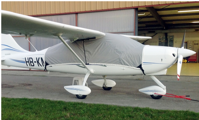
Tecnam P2008 Travel Cover

Travel Covers are made with Silver Solution-Dyed Polyester fabric and only lined over the windshield to save weight. The material is lightweight and more compact for easy stowage in the aircraft. The polyester material is water resistant, but only intended for occasional use outside. We also have an ultra lightweight material available for fitted hangar dust covers. For daily outdoor use, the non-travel Sunbrella Cover is the best choice.