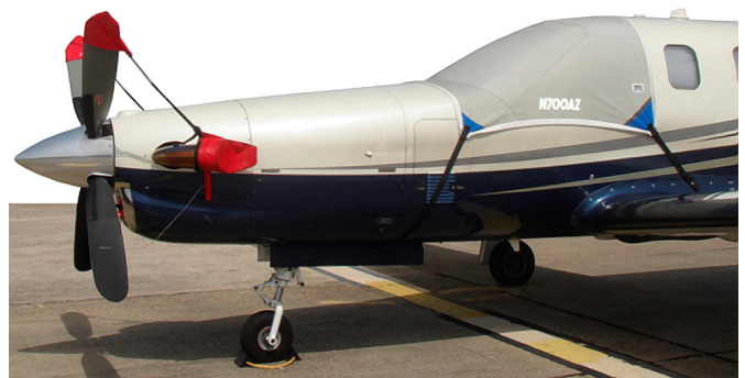
TBM700 Cockpit Cover, Engine Plugs, Prop Tie/Exhaust Covers