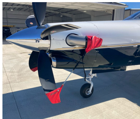
TBM 900 Prop Tie/Exhaust Covers