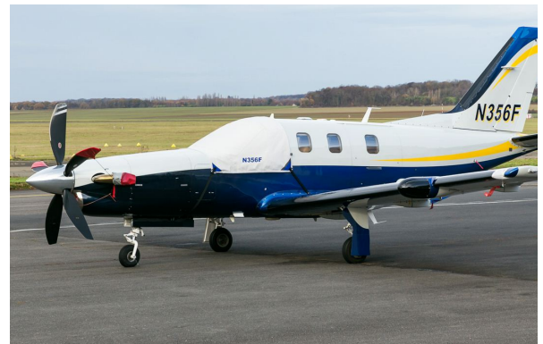
Socata TBM 700 Cockpit Cover (Not Bruce's Prop/Exhaust)