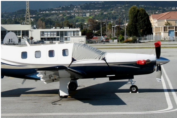
Socata TBM Cockpit Cover