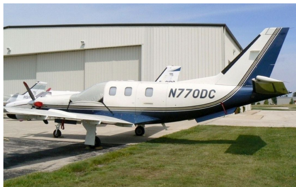
Socata TBM 700 Cockpit Cover, Prop Tie/Exhaust Cover Set