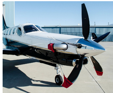
TBM 900 Prop Tie/Exhaust Covers