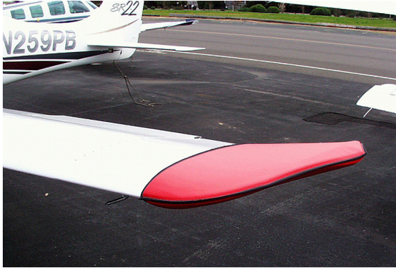
Cirrus SR-22 Wingtip Pad (also available for the Horiz. Stab.)

Designed to prevent damage to the aircraft extremities in crowded hangars, these products are made of bright red Naugahyde and thickly padded with a sandwich of closed cell foam.