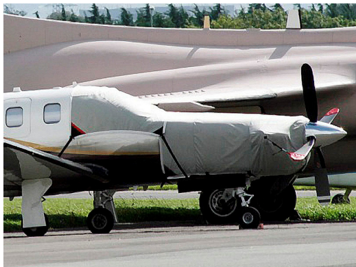
Socata TBM Cockpit Cover, Engine Cover

This cover type is made from Silver Acrylic Sunbrella canvas and is 100% lined with a soft and smooth microfiber. Bruce's Custom Covers developed this material combination especially for aircraft protection. The outer material is medium weight and treated for water resistance, UV resistance and anti-static buildup. The inner lining is a very soft and smooth microfiber to prevent scratching. The material is very reflective, and tests show that the cabin interior temperature can be reduced to near-ambient temperature on the hottest of days. It is water, ice and snow repellent, yet breathable to allow moisture to escape from between the cover and the aircraft surface.