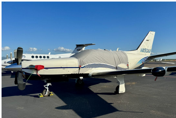
Socata TBM 850 Travel Weight Canopy Cover, Prop Tie/Exhaust Covers

Travel Covers are made with Silver Solution-Dyed Polyester fabric and only lined over the windshield to save weight. The material is lightweight and more compact for easy stowage in the aircraft. The polyester material is water resistant, but only intended for occasional use outside. We also have an ultra lightweight material available for fitted hangar dust covers. For daily outdoor use, the non-travel Sunbrella Cover is the best choice.