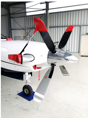
Piper PA-46-500TP PropTie/Exhaust Cover Set

This cover type is made from Silver Acrylic Sunbrella canvas and is 100% lined with a soft and smooth microfiber. Bruce's Custom Covers developed this material combination especially for aircraft protection. The outer material is medium weight and treated for water resistance, UV resistance and anti-static buildup. The inner lining is a very soft and smooth microfiber to prevent scratching. The material is very reflective, and tests show that the cabin interior temperature can be reduced to near-ambient temperature on the hottest of days. It is water, ice and snow repellent, yet breathable to allow moisture to escape from between the cover and the aircraft surface.