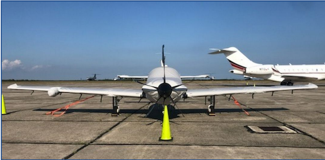
Socata TBM Canopy, Engine, Wing &amp; Horizontal Stabilizer Covers