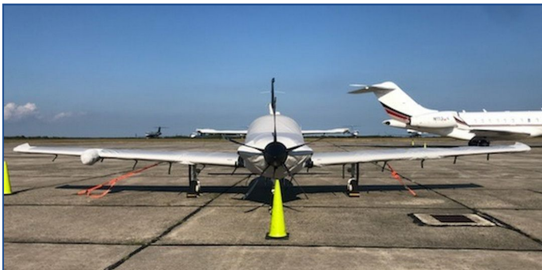
Socata TBM Canopy, Engine, Wing &amp; Horizontal Stabilizer Covers