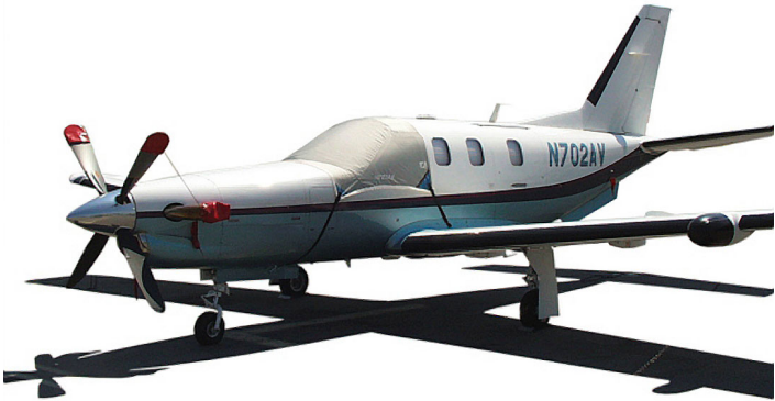
TBM 700 Cockpit Cover, Engine Plugs, Prop Tie/Exhaust Covers