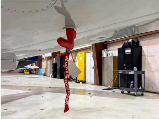
Compagnie Daher TBM 700 Pitot Covers (set of 2)

Engine Inlet Plugs are custom fit for your Socata TBM 700, 750, 850, 900, 910, 930, 940, 960 intakes, made with heavy-duty vinyl material, and stuffed with a single block of sculpted urethane foam. Each plug has a zipper that allows the foam to be removed and dried if necessary. Engine plugs have warning flags that are visible from the cockpit or 'remove before flight' streamers sewn onto the face of the plugs. Most plugs are imprinted with the aircraft registration number in black for an extra charge. Storage bag NOT included. Engine plugs may be inserted after flight when the engine is still warm. Engine Inlet Plugs are commonly referred to as Cowl Plugs, Intake Plugs, Cowl Blocks, Engine Blocks, and Engine Bung s. Designed to prevent damage to the aircraft extremities in crowded hangars, these products are made of bright red Naugahyde and thickly padded with a sandwich of closed cell foam.