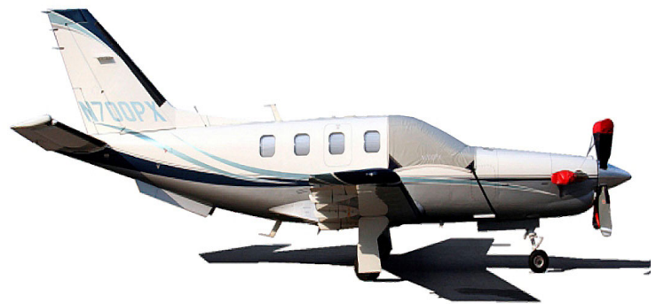
TBM 700 Cockpit Cover, Prop Tie-down/Exhaust Covers, & Engine Inlet Plugs