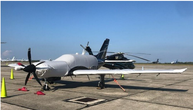
Socata TBM Canopy, Engine, Wing & Horizontal Stabilizer Covers

This cover type is made from Silver Acrylic Sunbrella canvas and is 100% lined with a soft and smooth microfiber. Bruce's Custom Covers developed this material combination especially for aircraft protection. The outer material is medium weight and treated for water resistance, UV resistance and anti-static buildup. The inner lining is a very soft and smooth microfiber to prevent scratching. The material is very reflective, and tests show that the cabin interior temperature can be reduced to near-ambient temperature on the hottest of days. It is water, ice and snow repellent, yet breathable to allow moisture to escape from between the cover and the aircraft surface.