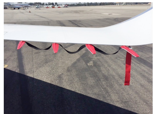
Example photo from a Biz Jet