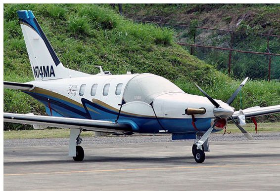
TBM 850 Cockpit Cover

Travel Covers are made with Silver Solution-Dyed Polyester fabric and only lined over the windshield to save weight. The material is lightweight and more compact for easy stowage in the aircraft. The polyester material is water resistant, but only intended for occasional use outside. We also have an ultra lightweight material available for fitted hangar dust covers. For daily outdoor use, the non-travel Sunbrella Cover is the best choice.