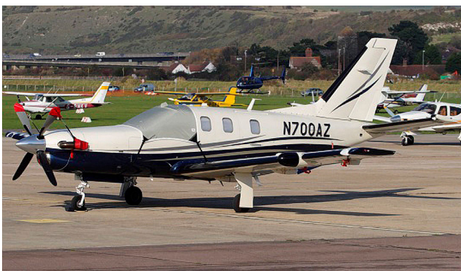
TBM 700 Cockpit Cover, Prop Tie-down/Exhaust Covers, & Engine Inlet Plugs

Engine Inlet Plugs are custom fit for your Socata TBM 700, 750, 850, 900, 910, 930, 940, 960 intakes, made with heavy-duty vinyl material, and stuffed with a single block of sculpted urethane foam. Each plug has a zipper that allows the foam to be removed and dried if necessary. Engine plugs have warning flags that are visible from the cockpit or 'remove before flight' streamers sewn onto the face of the plugs. Most plugs are imprinted with the aircraft registration number in black for an extra charge. Storage bag NOT included. Engine plugs may be inserted after flight when the engine is still warm. Engine Inlet Plugs are commonly referred to as Cowl Plugs, Intake Plugs, Cowl Blocks, Engine Blocks, and Engine Bung s. Designed to prevent damage to the aircraft extremities in crowded hangars, these products are made of bright red Naugahyde and thickly padded with a sandwich of closed cell foam.