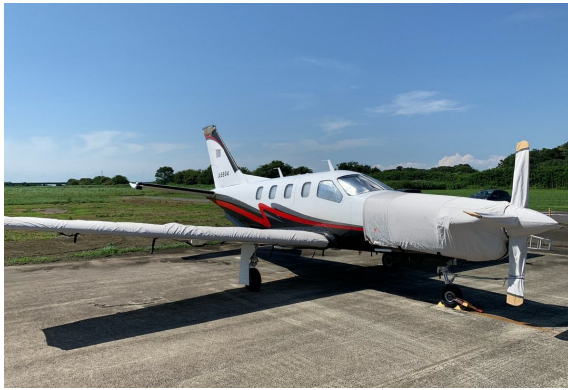
TBM 700 Wing, Engine, Prop Covers

WINTER USE MATERIAL - Made with Solution-Dyed Polyester fabric, this option is intended for seasonal use to aid in deicing, rain mitigation, or for occasional travel. The material is lighter and more compact, but more susceptible to UV damage and may have a shorter useful life if used continuously outside than the all-year use material.