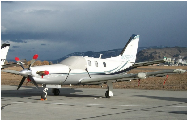
Socata TBM 700 Cockpit, Wing & Horizontal Stab. Covers

This cover type is made from Silver Acrylic Sunbrella canvas and is 100% lined with a soft and smooth microfiber. Bruce's Custom Covers developed this material combination especially for aircraft protection. The outer material is medium weight and treated for water resistance, UV resistance and anti-static buildup. The inner lining is a very soft and smooth microfiber to prevent scratching. The material is very reflective, and tests show that the cabin interior temperature can be reduced to near-ambient temperature on the hottest of days. It is water, ice and snow repellent, yet breathable to allow moisture to escape from between the cover and the aircraft surface.