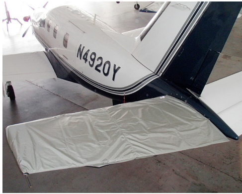
TBM 700, 850 Horizontal Stabilizer Covers

WINTER USE MATERIAL - Made with Solution-Dyed Polyester fabric, this option is intended for seasonal use to aid in deicing, rain mitigation, or for occasional travel. The material is lighter and more compact, but more susceptible to UV damage and may have a shorter useful life if used continuously outside than the all-year use material.