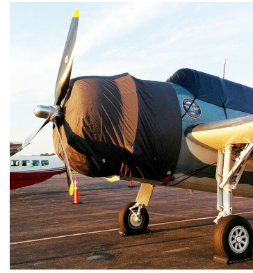
TBM Avenger Engine Cover