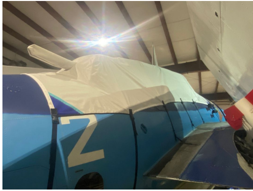
Grumman TBF & TBM Avenger Canopy Cover

the hottest of days. It is water, ice and snow repellent, yet breathable to allow moisture to escape from between the cover and the aircraft surface.