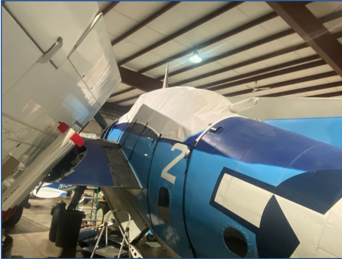
Grumman TBF &amp; TBM Avenger Canopy Cover