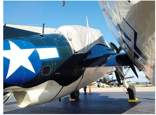
Grumman TBF Canopy Cover