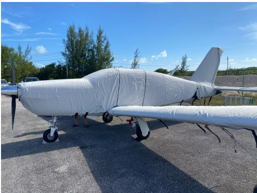
Socata TB-20 Trinidad Complete Cover Set