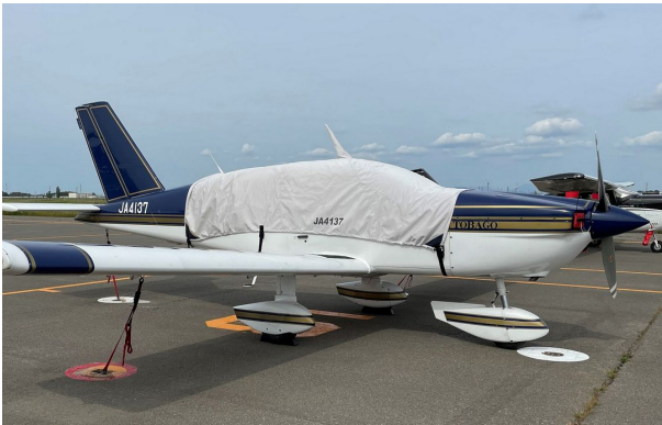
Socata TB10 Canopy Cover, Engine Plugs

Engine Inlet Plugs are custom fit for your Socata TB9-GT, Tobago: TB10-GT & TB200-GT, Trinidad: TB20-GT, TB21-GT intakes, made with heavy-duty vinyl material, and stuffed with a single block of sculpted urethane foam. Each plug has a zipper that allows the foam to be removed and dried if necessary. Engine plugs have warning flags that are visible from the cockpit or 'remove before flight' streamers sewn onto the face of the plugs. Most plugs are imprinted with the aircraft registration number in black for an extra charge. Storage bag NOT included. Engine plugs may be inserted after flight when the engine is still warm. Engine Inlet Plugs are commonly referred to as Cowl Plugs, Intake Plugs, Cowl Blocks, Engine Blocks, and Engine Bunges.