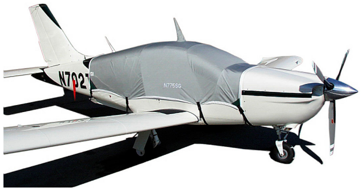
TB20 Standard Canopy Cover