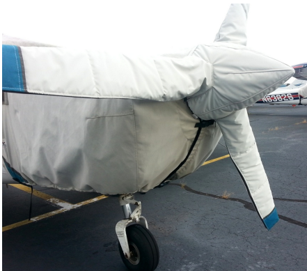
Socata Trinidad/Tobago Engine & Prop Covers

This cover type is made from Silver Acrylic Sunbrella canvas and is 100% lined with a soft and smooth microfiber. Bruce's Custom Covers developed this material combination especially for aircraft protection. The outer material is medium weight and treated for water resistance, UV resistance and anti-static buildup. The inner lining is a very soft and smooth microfiber to prevent scratching. The material is very reflective, and tests show that the cabin interior temperature can be reduced to near-ambient temperature on the hottest of days. It is water, ice and snow repellent, yet breathable to allow moisture to escape from between the cover and the aircraft surface.