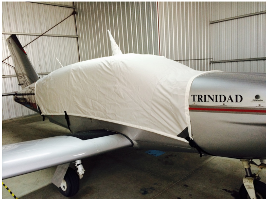
Trinidad Canopy Cover