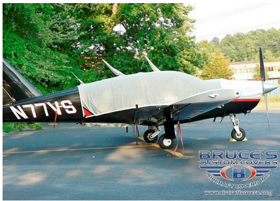
Socata TB20 Canopy Cover