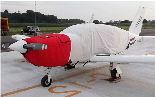
Socata TB-20/21Extended Canopy Cover and Insulated Engine Cover