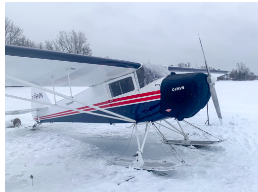
Taylorcraft Models B & F Insulated Engine Cover