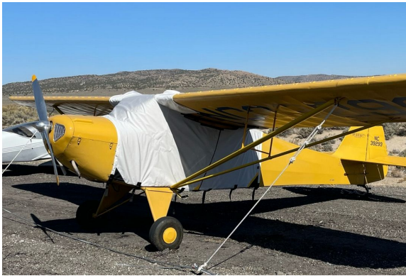
Taylorcraft BC-12D Extended Canopy Cover

This cover type is made from Silver Acrylic Sunbrella canvas and is 100% lined with a soft and smooth microfiber. Bruce's Custom Covers developed this material combination especially for aircraft protection. The outer material is medium weight and treated for water resistance, UV resistance and anti-static buildup. The inner lining is a very soft and smooth microfiber to prevent scratching. The material is very reflective, and tests show that the cabin interior temperature can be reduced to near-ambient temperature on the hottest of days. It is water, ice and snow repellent, yet breathable to allow moisture to escape from between the cover and the aircraft surface.