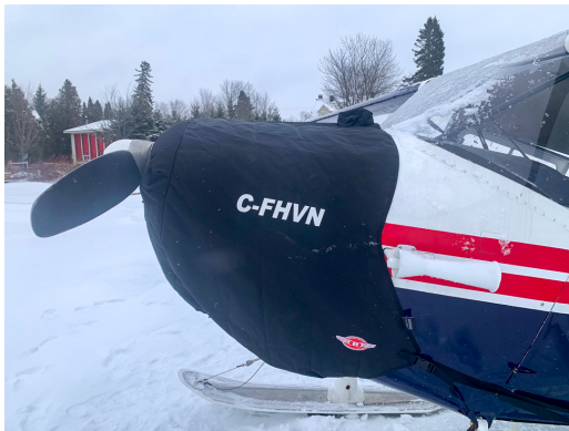
Taylorcraft Models B & F Insulated Engine Cover

This cover type is made from Silver Acrylic Sunbrella canvas and is 100% lined with a soft and smooth microfiber. Bruce's Custom Covers developed this material combination especially for aircraft protection. The outer material is medium weight and treated for water resistance, UV resistance and anti-static buildup. The inner lining is a very soft and smooth microfiber to prevent scratching. The material is very reflective, and tests show that the cabin interior temperature can be reduced to near-ambient temperature on the hottest of days. It is water, ice and snow repellent, yet breathable to allow moisture to escape from between the cover and the aircraft surface.