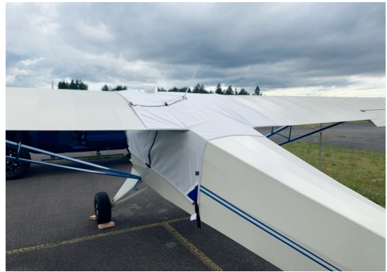
Taylorcraft Models F19 Over-The-Top Canopy Cover