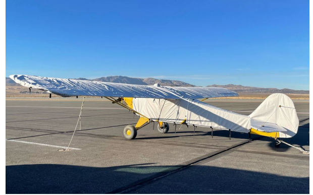
Taylorcraft BC-12D Extended Canopy, Wing & Empennage Covers