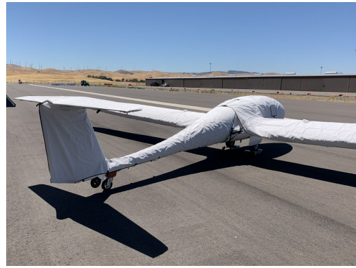
Pipistrel Taurus & Electro Empennage Cover, Incl. Horiz. Stab., All Year Use