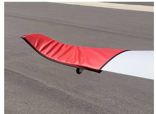
Pipistrel Taurus & Electro Wingtip Pads