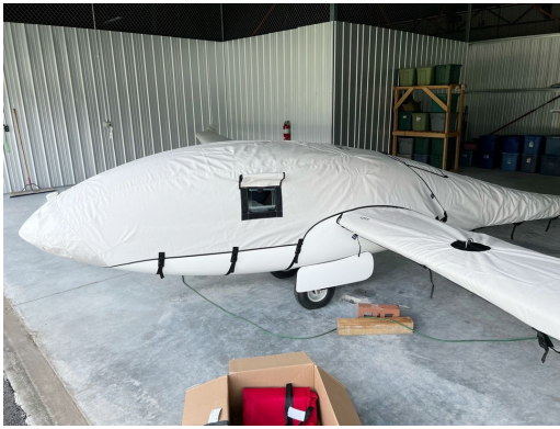
Pipistrel Taurus Complete Cover Set