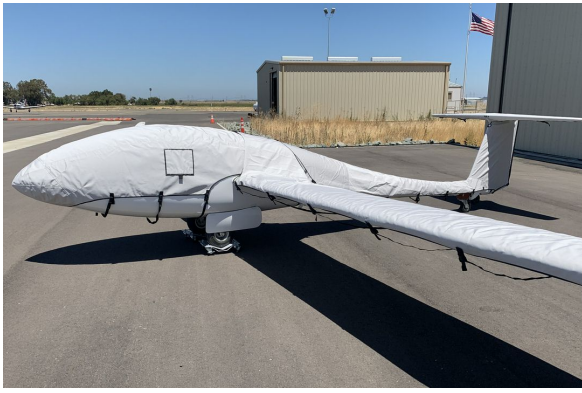
Pipistrel Taurus & Electro Canopy/Nose Cover, All Year Use