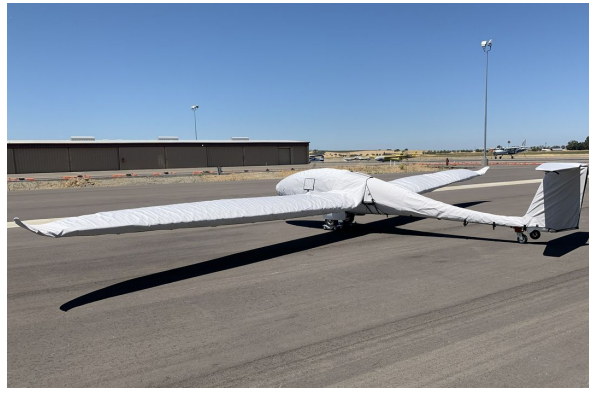
Pipistrel Taurus & Electro Wing Covers, 15 Meter Wingspan, All Year Use