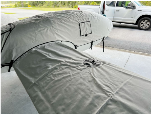
Pipistrel Taurus Complete Cover Set

WINTER USE MATERIAL - Made with Solution-Dyed Polyester fabric, this option is intended for seasonal use to aid in deicing, rain mitigation, or for occasional travel. The material is lighter and more compact, but more susceptible to UV damage and may have a shorter useful life if used continuously outside than the all-year use material.