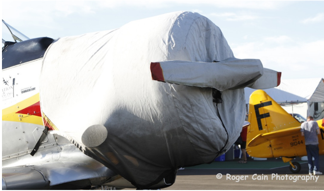
North American T6 Engine & Prop Cover

Travel Covers are made with Silver Solution-Dyed Polyester fabric and only lined over the windshield to save weight. The material is lightweight and more compact for easy stowage in the aircraft. The polyester material is water resistant, but only intended for occasional use outside. We also have an ultra lightweight material available for fitted hangar dust covers. For daily outdoor use, the non-travel Sunbrella Cover is the best choice.