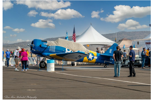
North American T6 Canopy Cover