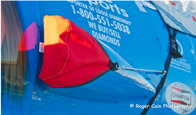
North American T6 Carb Air Scoop Cover