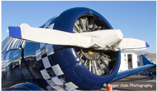
North American T6 Prop Cover