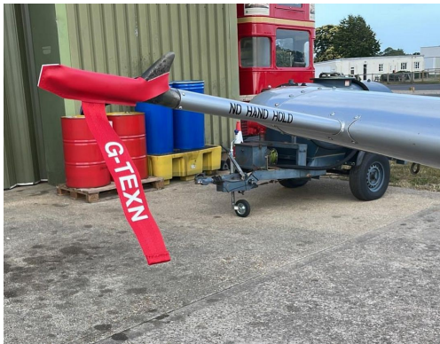
T6 Harvard Pitot Cover, shark fin type

Engine Inlet Plugs are custom fit for your North American T6, SNJ, Harvard intakes, made with heavy-duty vinyl material, and stuffed with a single block of sculpted urethane foam. Each plug has a zipper that allows the foam to be removed and dried if necessary. Engine plugs have warning flags that are visible from the cockpit or 'remove before flight' streamers sewn onto the face of the plugs. Most plugs are imprinted with the aircraft registration number in black for an extra charge. Storage bag NOT included. Engine plugs may be inserted after flight when the engine is still warm. Engine Inlet Plugs are commonly referred to as Cowl Plugs, Intake Plugs, Cowl Blocks, Engine Blocks, and Engine Bungs.