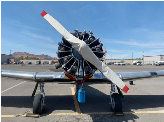
North American T6 Prop Cover

This cover type is made from Silver Acrylic Sunbrella canvas and is 100% lined with a soft and smooth microfiber. Bruce's Custom Covers developed this material combination especially for aircraft protection. The outer material is medium weight and treated for water resistance, UV resistance and anti-static buildup. The inner lining is a very soft and smooth microfiber to prevent scratching. The material is very reflective, and tests show that the cabin interior temperature can be reduced to near-ambient temperature on the hottest of days. It is water, ice and snow repellent, yet breathable to allow moisture to escape from between the cover and the aircraft surface.