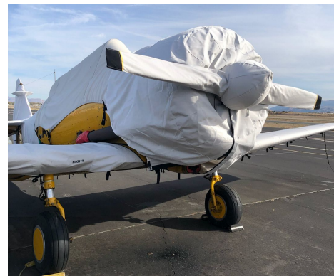
North American T6 Prop & Engine Covers