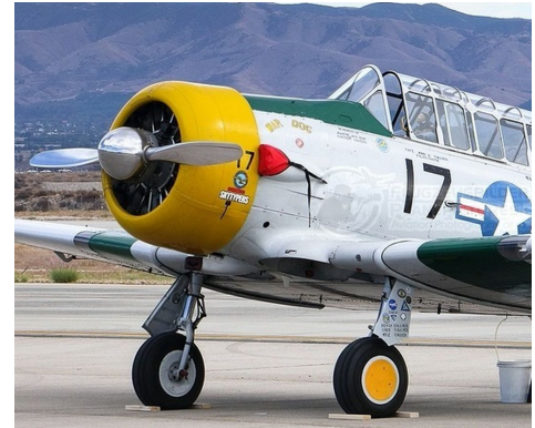
North American T6 Carb Air Scoop Cover