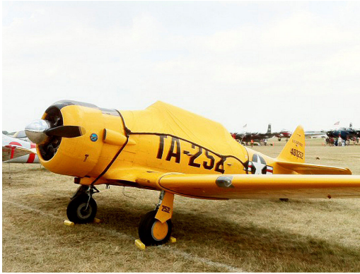
North American T6 Canopy Cover

This cover type is made from Silver Acrylic Sunbrella canvas and is 100% lined with a soft and smooth microfiber. Bruce's Custom Covers developed this material combination especially for aircraft protection. The outer material is medium weight and treated for water resistance, UV resistance and anti-static buildup. The inner lining is a very soft and smooth microfiber to prevent scratching. The material is very reflective, and tests show that the cabin interior temperature can be reduced to near-ambient temperature on the hottest of days. It is water, ice and snow repellent, yet breathable to allow moisture to escape from between the cover and the aircraft surface.