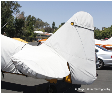
North American T6 Empennage Cover

WINTER USE MATERIAL - Made with Solution-Dyed Polyester fabric, this option is intended for seasonal use to aid in deicing, rain mitigation, or for occasional travel. The material is lighter and more compact, but more susceptible to UV damage and may have a shorter useful life if used continuously outside than the all-year use material.