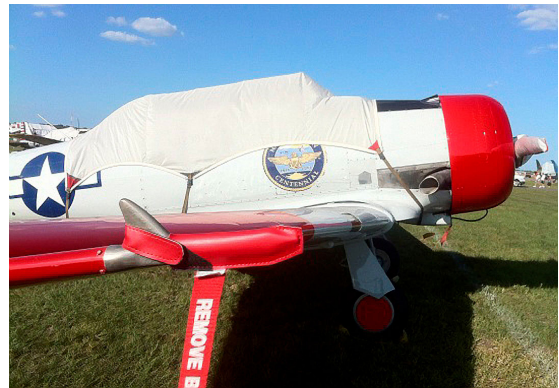
T6 Pitot, Canopy & Prop Covers