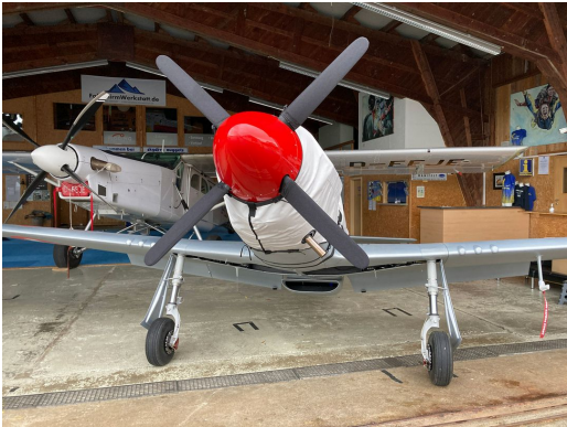
SW-51 Mustang Engine Cover

This cover type is made from Silver Acrylic Sunbrella canvas and is 100% lined with a soft and smooth microfiber. Bruce's Custom Covers developed this material combination especially for aircraft protection. The outer material is medium weight and treated for water resistance, UV resistance and anti-static buildup. The inner lining is a very soft and smooth microfiber to prevent scratching. The material is very reflective, and tests show that the cabin interior temperature can be reduced to near-ambient temperature on the hottest of days. It is water, ice and snow repellent, yet breathable to allow moisture to escape from between the cover and the aircraft surface.