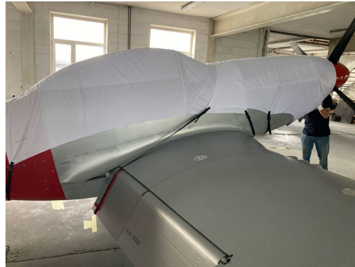
Scalewings SW-51 Mustang Canopy & Engine Covers, test fit covers