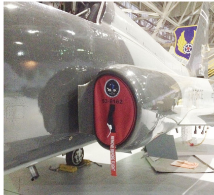
Northrop Grumman T38-C Intake Plugs

The Engine Inlet Plugs are custom fit for your Northrop Talon T-38 Trainer intakes, made with heavy-duty vinyl material, and stuffed with a single block of sculpted urethane foam. Each plug has a zipper that allows the foam to be removed and dried if necessary. Engine plugs have 'remove before flight' streamers sewn onto the face of the plugs. Most plugs are imprinted with the aircraft registration number in black for an extra charge. Storage bag NOT included. Engine plugs may be inserted after flight when the engine is still warm. Engine Inlet Plugs are commonly referred to as Cowl Plugs, Intake Plugs, Cowl Blocks, Engine Blocks, and Engine Bungs.