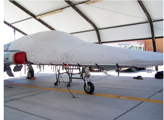
Northrup F5 Talon Canopy Cover