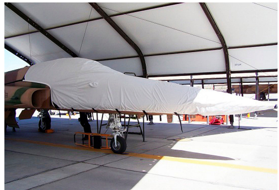
Northup F-5 Talon Canopy/Nose Cover