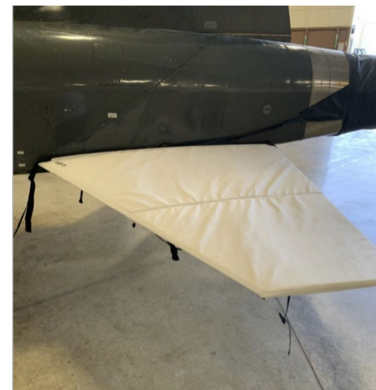
Northrup T-38 Horizontal Stabilizer Covers