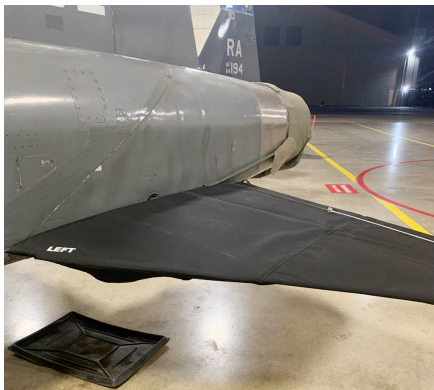
Northrop T-38 Horizontal Stabilizer Cover

WINTER USE MATERIAL - Made with Solution-Dyed Polyester fabric, this option is intended for seasonal use to aid in deicing, rain mitigation, or for occasional travel. The material is lighter and more compact, but more susceptible to UV damage and may have a shorter useful life if used continuously outside than the all-year use material.