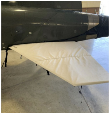
Northrup T-38 Horizontal Stabilizer Covers

WINTER USE MATERIAL - Made with Solution-Dyed Polyester fabric, this option is intended for seasonal use to aid in deicing, rain mitigation, or for occasional travel. The material is lighter and more compact, but more susceptible to UV damage and may have a shorter useful life if used continuously outside than the all-year use material.