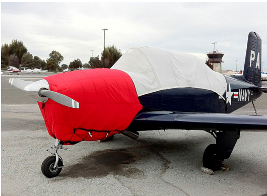
T-34A Insulated Engine Cover