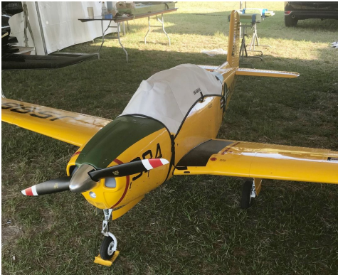
Beechcraft T-34B Mentor Canopy Cover, for 36% Scale Model