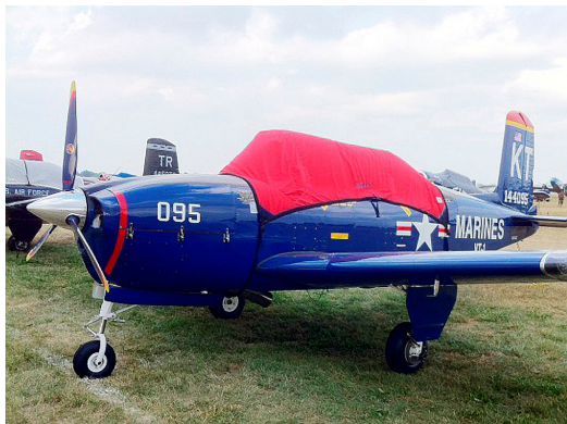
The T34 Canopy Cover

This cover type is made from Silver Acrylic Sunbrella canvas and is 100% lined with a soft and smooth microfiber. Bruce's Custom Covers developed this material combination especially for aircraft protection. The outer material is medium weight and treated for water resistance, UV resistance and anti-static buildup. The inner lining is a very soft and smooth microfiber to prevent scratching. The material is very reflective, and tests show that the cabin interior temperature can be reduced to near-ambient temperature on the hottest of days. It is water, ice and snow repellent, yet breathable to allow moisture to escape from between the cover and the aircraft surface.