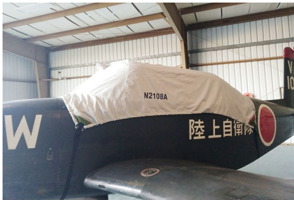
Fuji LM Canopy Cover