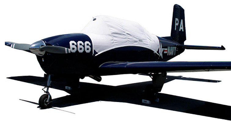
The T34 Canopy Cover

Travel Covers are made with Silver Solution-Dyed Polyester fabric and only lined over the windshield to save weight. The material is lightweight and more compact for easy stowage in the aircraft. The polyester material is water resistant, but only intended for occasional use outside. We also have an ultra lightweight material available for fitted hangar dust covers. For daily outdoor use, the non-travel Sunbrella Cover is the best choice.