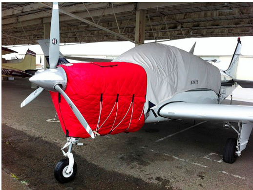
Beech Bonanza Insulated Engine Cover, fully enclosed

This cover type is made from Silver Acrylic Sunbrella canvas and is 100% lined with a soft and smooth microfiber. Bruce's Custom Covers developed this material combination especially for aircraft protection. The outer material is medium weight and treated for water resistance, UV resistance and anti-static buildup. The inner lining is a very soft and smooth microfiber to prevent scratching. The material is very reflective, and tests show that the cabin interior temperature can be reduced to near-ambient temperature on the hottest of days. It is water, ice and snow repellent, yet breathable to allow moisture to escape from between the cover and the aircraft surface.