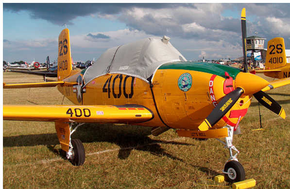
T34 Canopy Cover & Engine Inlet Plugs

of the plugs. Most plugs are imprinted with the aircraft registration number in black for an extra charge. Storage bag NOT included. Engine plugs may be inserted after flight when the engine is still warm. Engine Inlet Plugs are commonly referred to as Cowl Plugs, Intake Plugs, Cowl Blocks, Engine Blocks, and Engine Bunges.