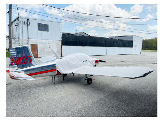
Thorp Sky Scooter Extended Canopy Cover & Wing Covers

This cover type is made from Silver Acrylic Sunbrella canvas and is 100% lined with a soft and smooth microfiber. Bruce's Custom Covers developed this material combination especially for aircraft protection. The outer material is medium weight and treated for water resistance, UV resistance and anti-static buildup. The inner lining is a very soft and smooth microfiber to prevent scratching. The material is very reflective, and tests show that the cabin interior temperature can be reduced to near-ambient temperature on the hottest of days. It is water, ice and snow repellent, yet breathable to allow moisture to escape from between the cover and the aircraft surface.