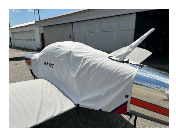
Thorp Sky Scooter Extended Canopy Cover & Wing Covers