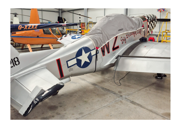
ScaleWings SW-51 Mustang Canopy Cover

the hottest of days. It is water, ice and snow repellent, yet breathable to allow moisture to escape from between the cover and the aircraft surface.