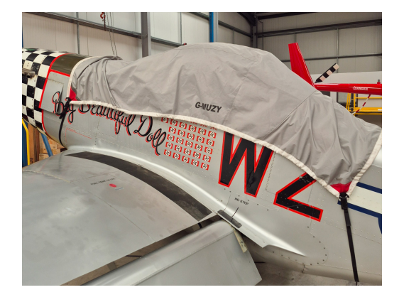
ScaleWings SW-51 Mustang Canopy Cover