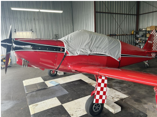
Swift Travel Cover, Light Weight Canopy Cover (Standard Canopy)