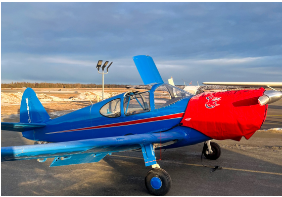
Globe Swift Insulated Engine Cover

This cover type is made from Silver Acrylic Sunbrella canvas and is 100% lined with a soft and smooth microfiber. Bruce's Custom Covers developed this material combination especially for aircraft protection. The outer material is medium weight and treated for water resistance, UV resistance and anti-static buildup. The inner lining is a very soft and smooth microfiber to prevent scratching. The material is very reflective, and tests show that the cabin interior temperature can be reduced to near-ambient temperature on the hottest of days. It is water, ice and snow repellent, yet breathable to allow moisture to escape from between the cover and the aircraft surface.