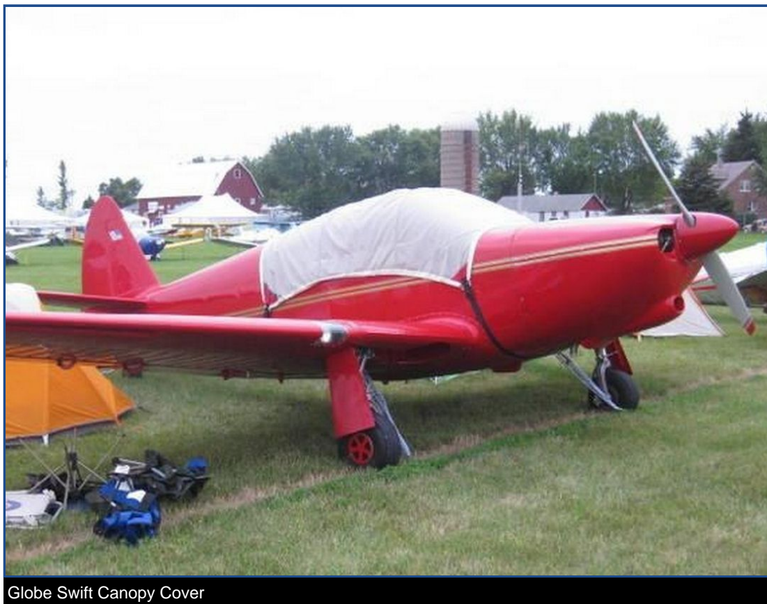
Globe Swift Canopy Cover