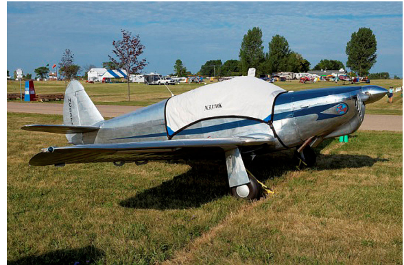
Globe Swift Canopy Cover