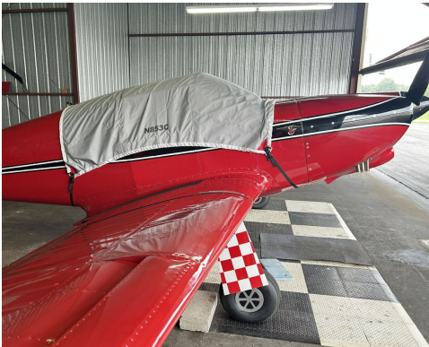
Swift Travel Cover, Light Weight Canopy Cover (Standard Canopy)

Travel Covers are made with Silver Solution-Dyed Polyester fabric and only lined over the windshield to save weight. The material is lightweight and more compact for easy stowage in the aircraft. The polyester material is water resistant, but only intended for occasional use outside. We also have an ultra lightweight material available for fitted hangar dust covers. For daily outdoor use, the non-travel Sunbrella Cover is the best choice.