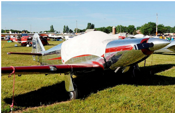
Standard Canopy Cover for Swift

This cover type is made from Silver Acrylic Sunbrella canvas and is 100% lined with a soft and smooth microfiber. Bruce's Custom Covers developed this material combination especially for aircraft protection. The outer material is medium weight and treated for water resistance, UV resistance and anti-static buildup. The inner lining is a very soft and smooth microfiber to prevent scratching. The material is very reflective, and tests show that the cabin interior temperature can be reduced to near-ambient temperature on the hottest of days. It is water, ice and snow repellent, yet breathable to allow moisture to escape from between the cover and the aircraft surface.