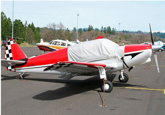
Standard Canopy Cover for Swift

This cover type is made from Silver Acrylic Sunbrella canvas and is 100% lined with a soft and smooth microfiber. Bruce's Custom Covers developed this material combination especially for aircraft protection. The outer material is medium weight and treated for water resistance, UV resistance and anti-static buildup. The inner lining is a very soft and smooth microfiber to prevent scratching. The material is very reflective, and tests show that the cabin interior temperature can be reduced to near-ambient temperature on the hottest of days. It is water, ice and snow repellent, yet breathable to allow moisture to escape from between the cover and the aircraft surface.