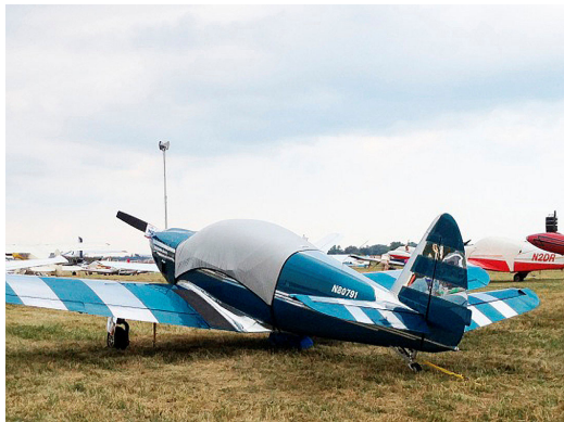
Swift Light Weight Canopy Cover