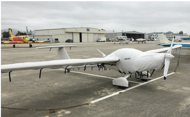
Lambda Canopy/Engine Cover and Wing Covers Distar Sundancer LSA Extended Canopy/Engine, Prop, Wheelpants, Wings & Empennage Covers