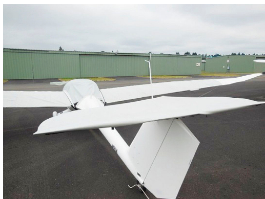
Lambda Canopy/Engine, Wing & Horiz. Stab. Covers