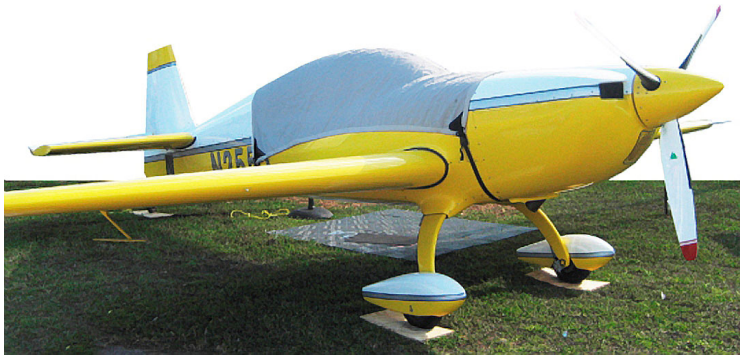
Extra 300/L Canopy Cover