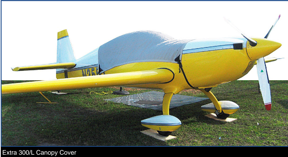
Extra 300/L Canopy Cover