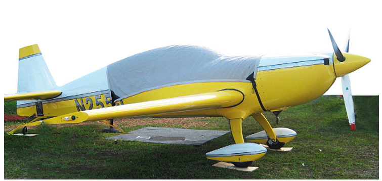
Extra 300L Canopy Cover