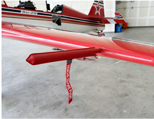
Sukhoi SU-26 Pitot Cover

Sukhoi SU-26 Pitot Tube Covers , NOT HEAT RESISTANT TYPE, are made of Naugahyde vinyl, and are designed to cover the entire pitot assembly. Slipping over the tube, the cover tightens around the base with a Velcro strap detail. A "Remove Before Flight" streamer is attached to the cover. Heat Resistant Pitot Covers are an upgrade to this design, and help prevent the pitot cover from melting onto the tube if the pitot heat is accidentally turned on while installed. If you want the set tethered together, please let us know.