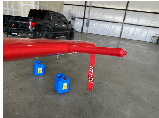
Sukhoi SU-26 Pitot Cover