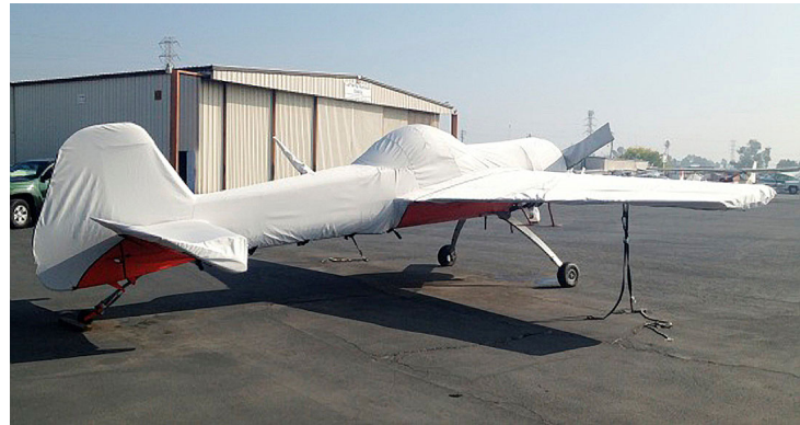
Sukhoi SU-26 Extended Canopy/Engine Cover Yak 55 Full Fuselage Cover w/ Detachable Wing Covers & Propellor/Spinner Cover