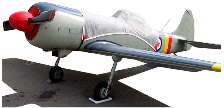
Yak 50 Canopy Cover