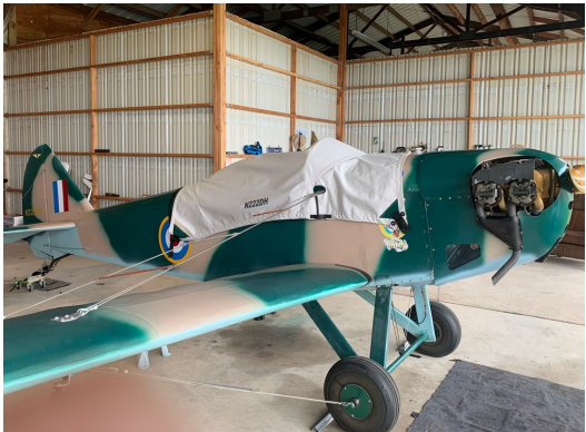
Bowers Fly Baby Canopy Cover